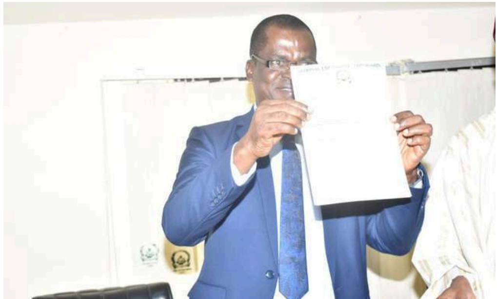
The Executive Governor of Cross River State, Senator Bassey Edet Otu Displaying the Certificate of Recognition of the New University Issued by the NUC

The SSG further explained that “the idea of a university of entrepreneurship is to provide an atmosphere whereby both the teachers and the students will