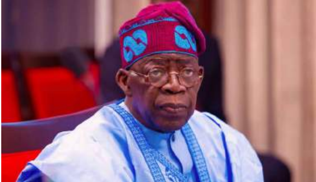
The President of the Federal Republic of Nigeria, President Bola Ahmed Tinubu, GCFR

P resident Bola Ahmed Tinubu has ordered the Federal Government to take over Nok University in Kachia, Kaduna State, and transform it into a Federal University. The News Agency of Nigeria reports that this directive follows a Federal High Court in Abuja's ruling to finalise the forfeiture of the privately-owned Nok University to the Federal Government.