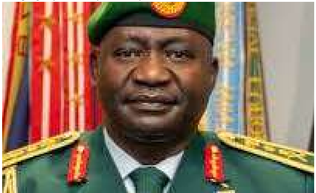
The Chief of Defense Staff of the Armed Forces of the Federal Republic of Nigeria, General Christopher Musa

highlighted that the new university would uplift the region and improve the quality of life for its residents.