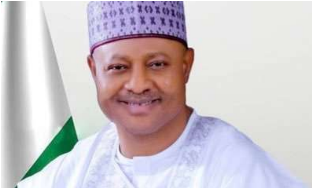
The Executive Governor of Kaduna State, Senator Uba Sani