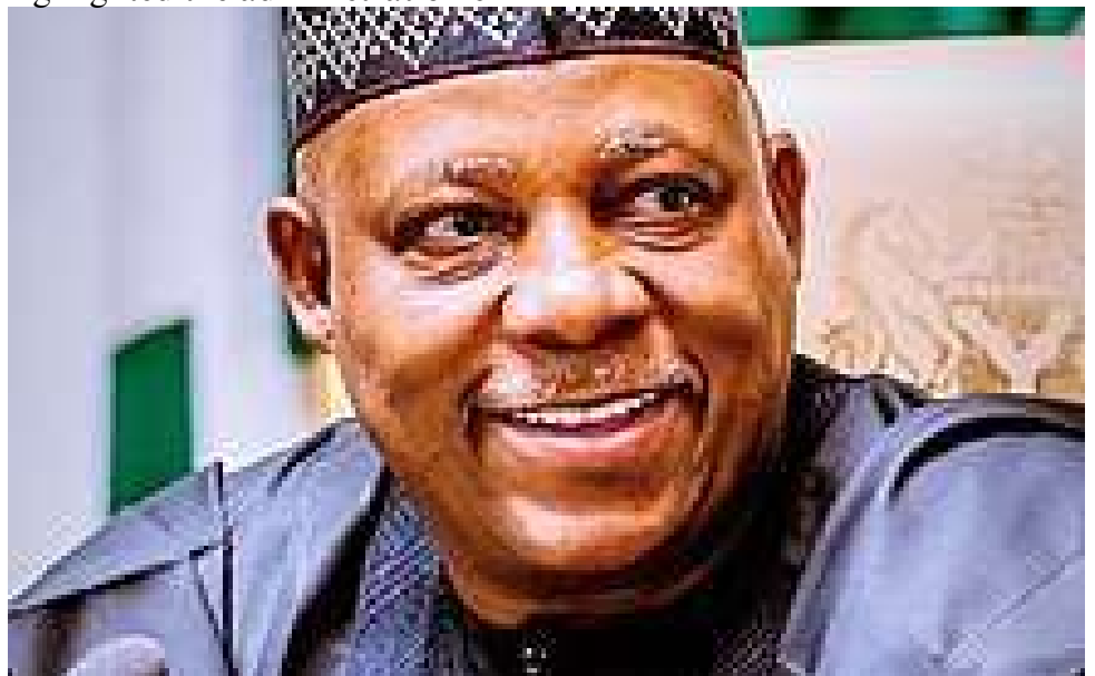
The Vice President of the Federal Republic of Nigeria, Senator Kashim Shettima, GCON

Senator Shettima also quoted Martin Luther King Jr., saying, "People fail to get along because they fear each other. "They fear each other because they don't know each other; they don't know each other because they have not communicated with each other. "I dare to add another quote by the same Martin Luther King Jr. where he said, 'We must either learn to live together as brothers, or we are going to die together as fools.'"