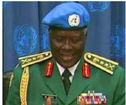
Former CDS, Gen. Martin Luther Agwai

Retired General Agwai described the day as one of great joy for those who had long awaited the establishment of a science-based university in Southern Kaduna. He