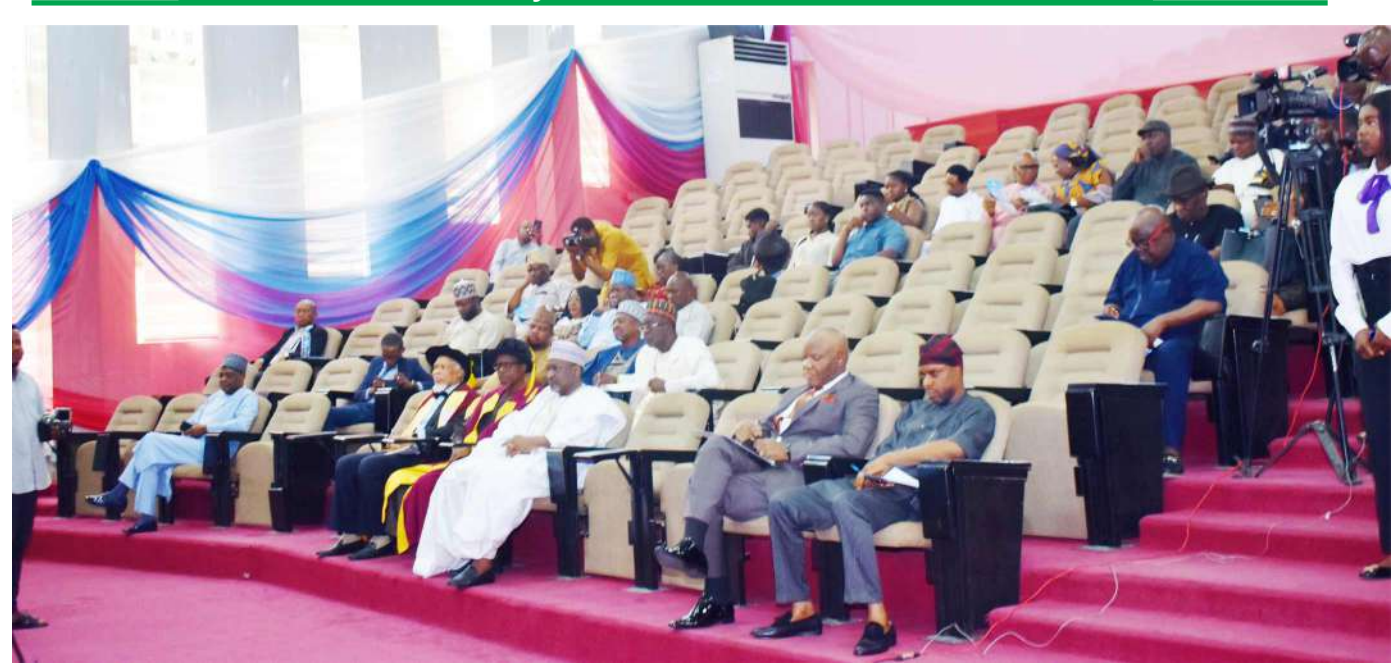
A cross section of the members of Nigerian Academy of Engineering (NAE) at the 4th Public Forum in NUC Abuja

right personnel to drive the fourth industrial revolution.