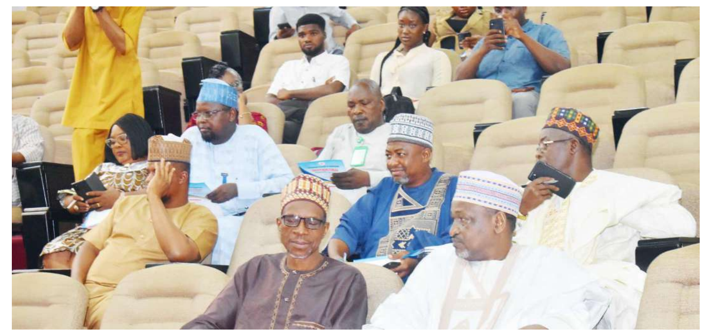
Other Stakeholders at the NAE Public Forum

not in the Public Forum to catalogue the challenges, but to provide innovative and sustainable solutions that included: Outcome Based Engineering Education by Council for Regulation of Engineering in Nigeria (COREN); CCMAS coordinated by NUC; Project Based Learning; Upgrading of Engineering Laboratories and Workshops;