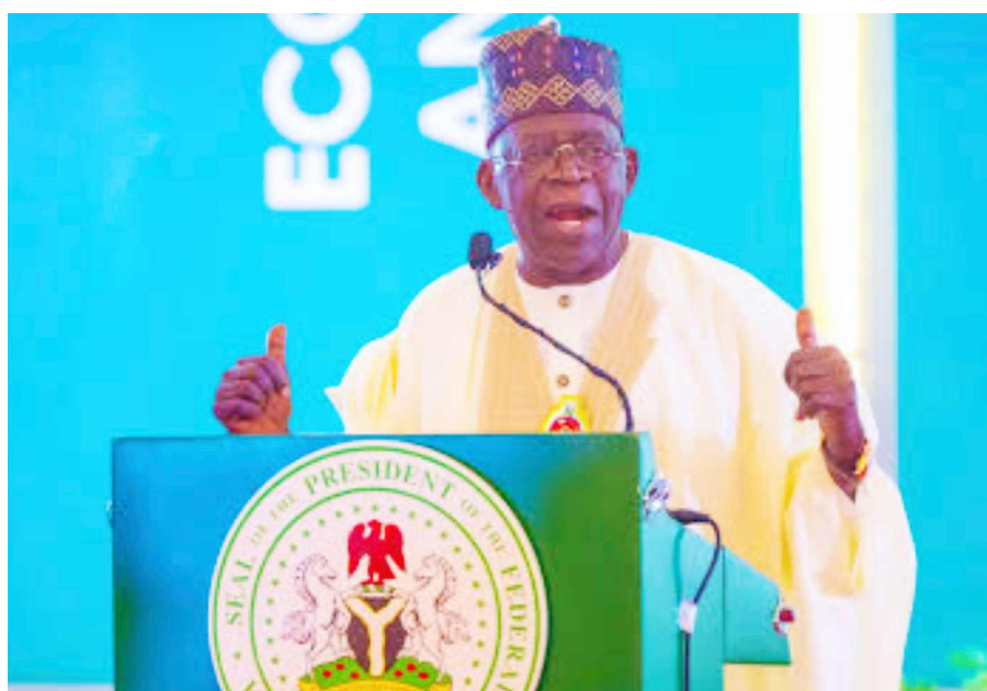
His Excellency Bola Ahmed Tinubu, GCFR President and Commander-in-Chief of the Armed Forces, Federal Republic of Nigeria

I am fully committed to the comprehensive integration of