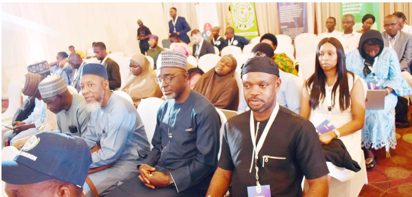
Others listening with rapt attention at the WACREN Conference