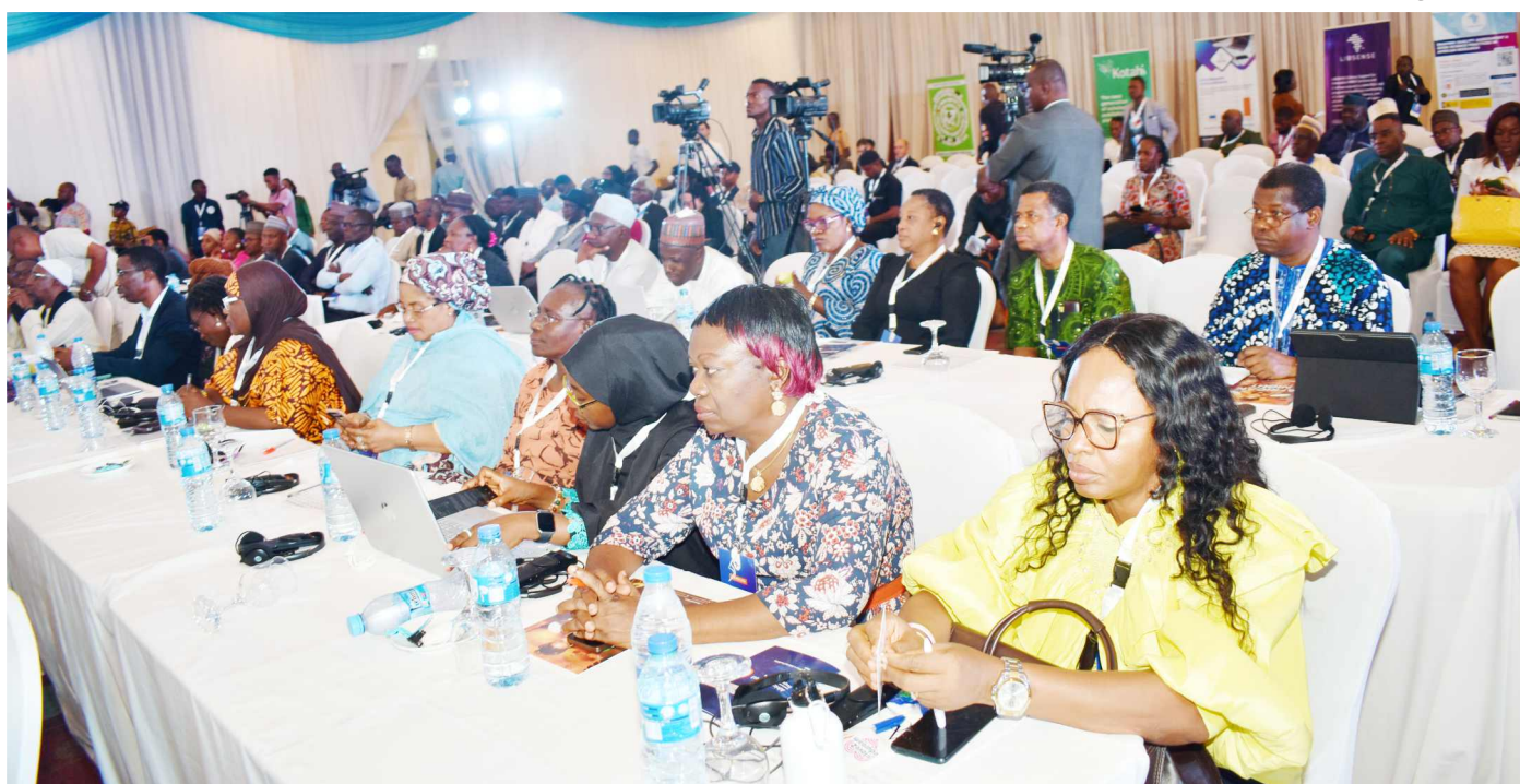
A cross section of other Stakeholders' at the WACREN Conference