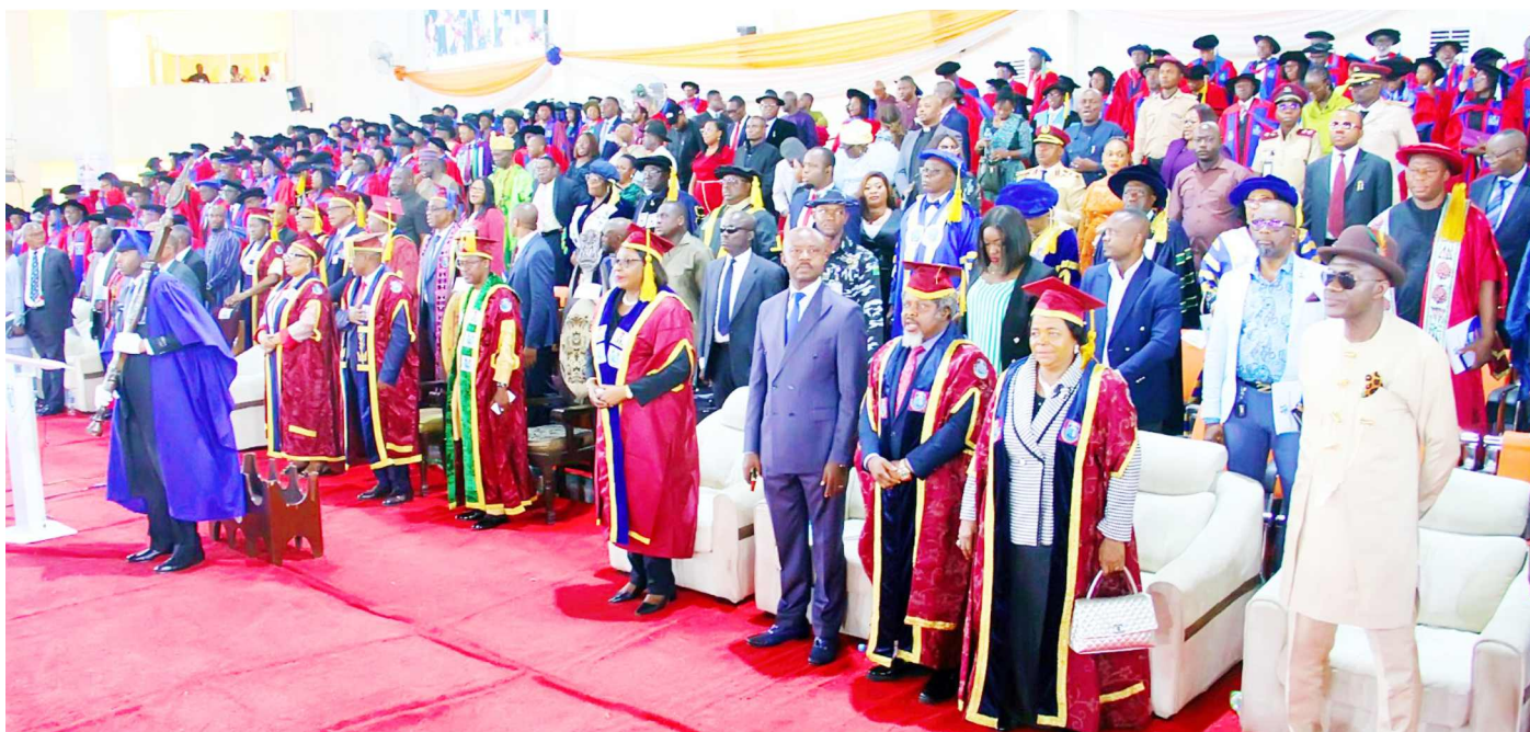
A cross section of the University's Principal Officers and dignitaries at the convocation ground

Again, not only have non-state actors enjoyed more visibility in shaping the security landscape, global trends indicate increasing