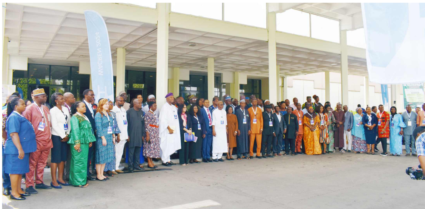
The Board and Management of WACREN with all the Participants in a group photograph, shortly after the 9th Edition of the Conference hosted by Nigeria in Abuja