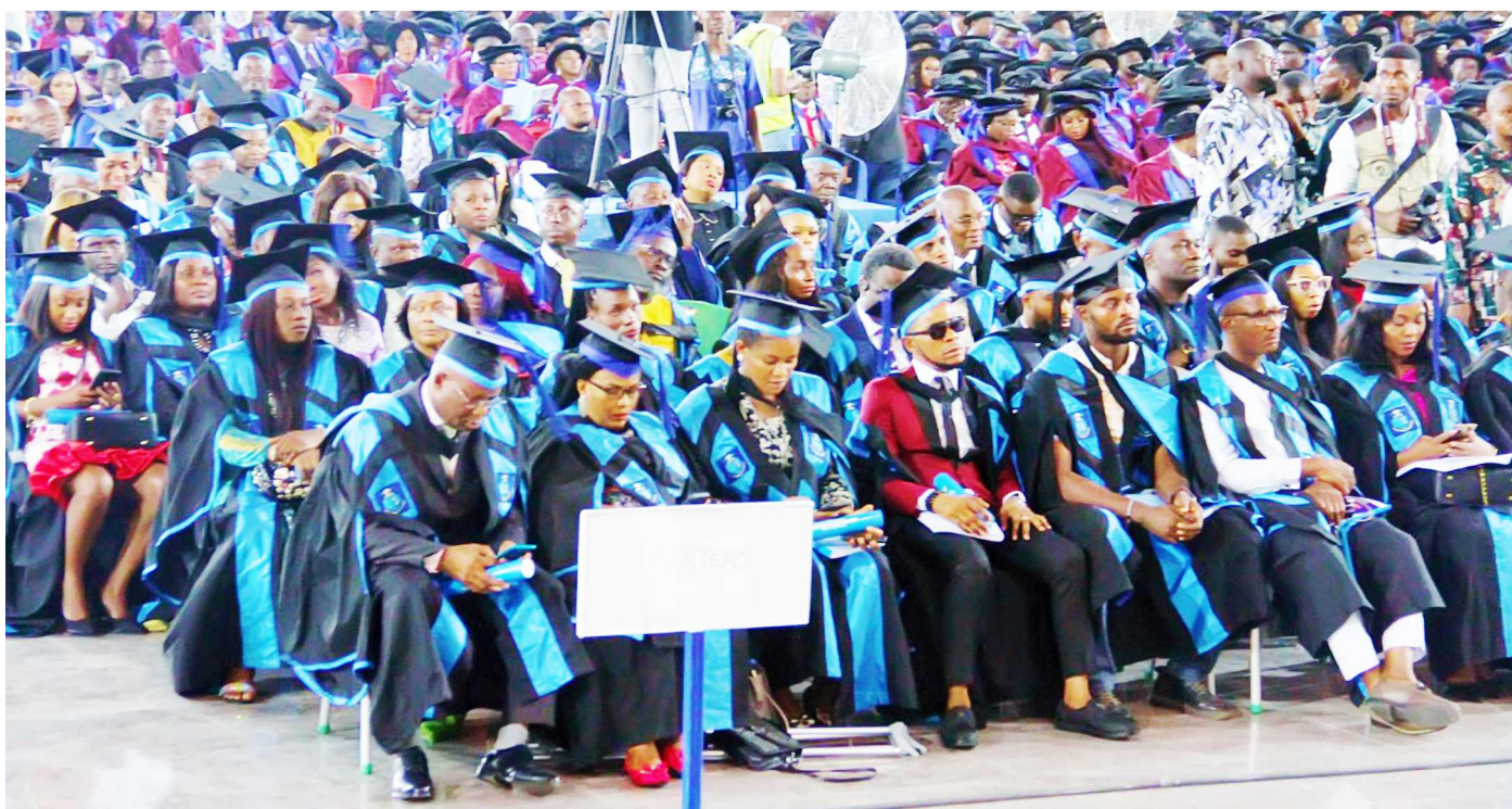
Some of the graduating students at the 34th Convocation Ceremony

Present at the convocation ceremony include top Government functionaries, Captains of Industry and Oil Magnates, Senators and members of the House of Reps, Royal Fathers, Rivers State Governor and members of the State House of Assembly members, the university's staff and students, parents, friends and well-wishers as well as the graduands.