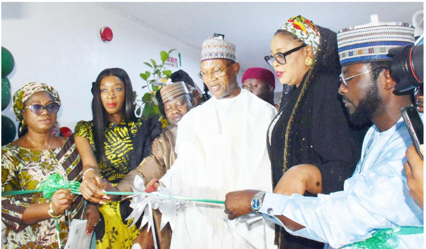
The Honourable Minister of Education, Prof Tahir Mamman , OON, SAN, 4th left being assisted by other dignitaries during the commissioning of the National Commission for Almajiri and Out-of-School Children Education, in Abuja.