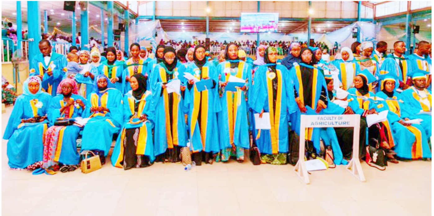
Some graduands of the Faculty of Agriculture during the Convocation Ceremony

Aliko Dangote and hosts of many prominent dignitaries.