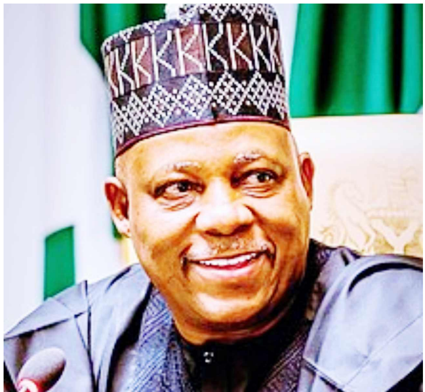
Alhaji Kashim Shettima, GCON Vice President, Federal Republic of Nigeria

Performing the commissioning, the Vice President reaffirmed the Federal Government's determination to enhance the economic development of the nation, through the provision of centres of academic excellence in Nigerian Universities aimed at producing some of the world's