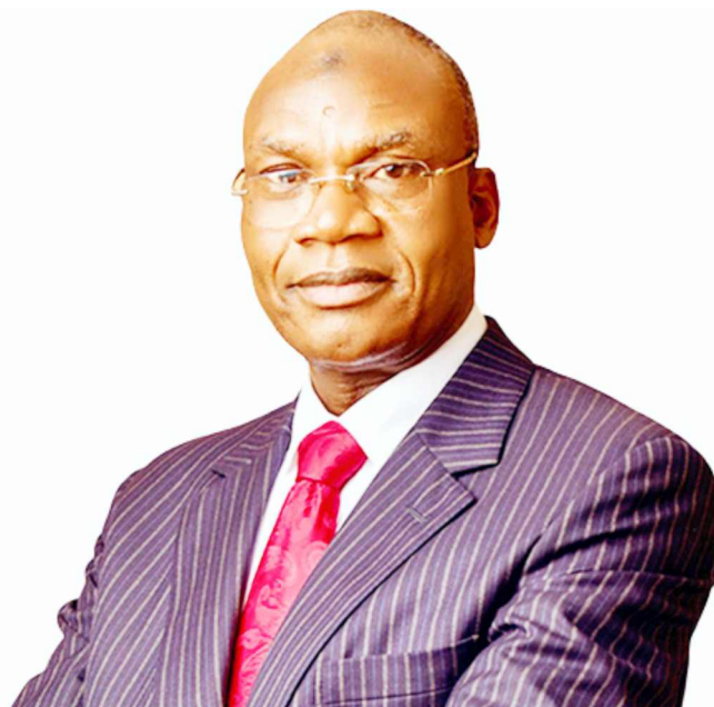
Prof. Tahir Mamman Honourable Minister of Education

are heading and it is not only this commission who is involved in the handling of out-of-school children, there are