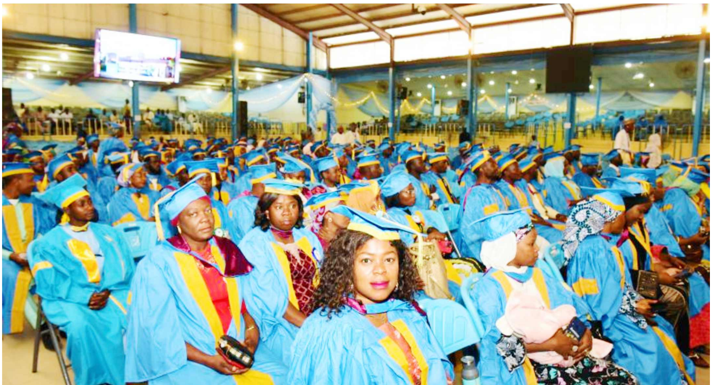
A cross section of the graduands during the Convocation Ceremony

The ceremony was graced by the distinguished Senate President, Mr. Godswill Akpabio; Minister of Education, Professor Tahir Mamman; Kano State Governor Engr. Abba Kabir Yusuf; former Senate President, Ahmad Lawan; Emir of Kano Alh. Aminu Ado Bayero and hosts of many distinguished Senators as well as Members of the Federal House of Representatives.