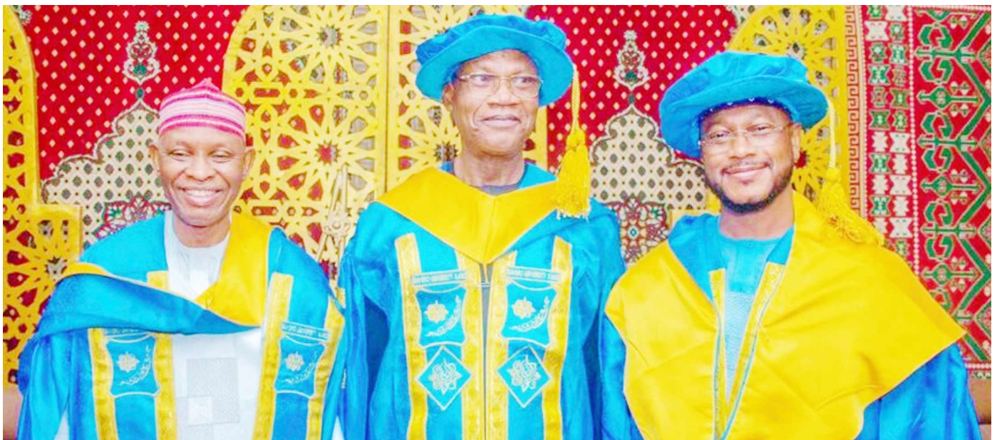
L - R: The Executive Governor of Kano State, Engr. Abba Yusuf; the Honorable Minister of Education, Prof. Tahir Mamman, OON, SAN and the Executive Governor of Zamfara State, Alh. Dauda Lawal Dare during the BUK convocation ceremony

He said the present administration was working towards revamping vocational and Tsangaya centres to improve education and expand skills