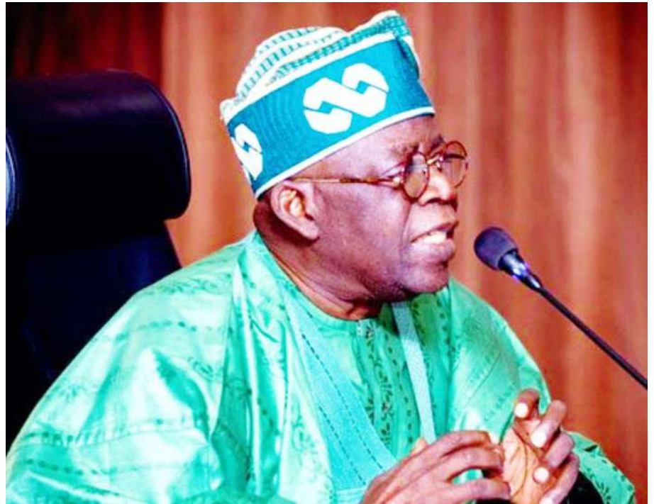
His Excellency Bola Ahmed Tinubu, GCFR President and Commander-in-Chief of the Armed Forces, Federal Republic of Nigeria

He declared that “On our part, we will ensure that motivational activities are put in place to ensure