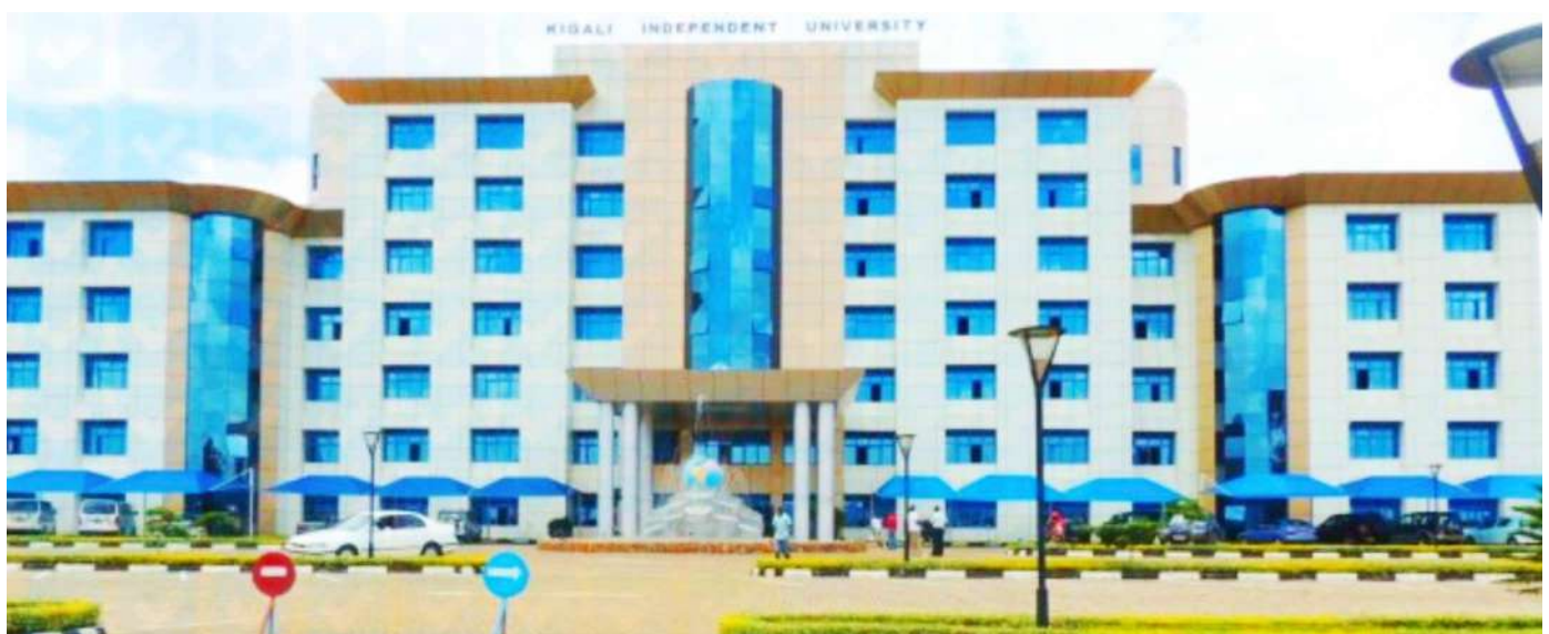
The University of Kigali’s Senate Building