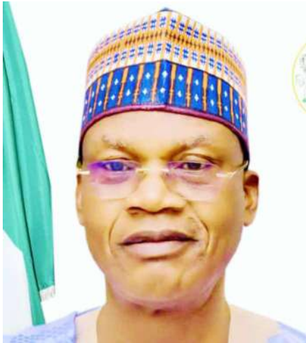
Professor Tahir Mamman The Honourable Minister of Education