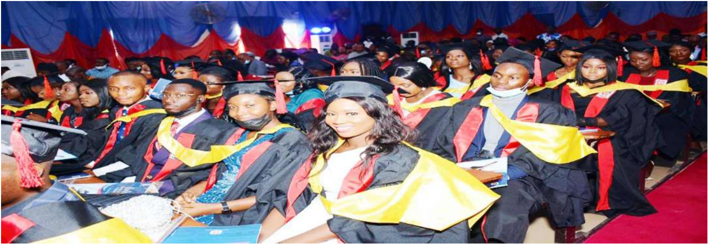
A cross Section of some of the graduating students

developmental projects and resources.” He declared.