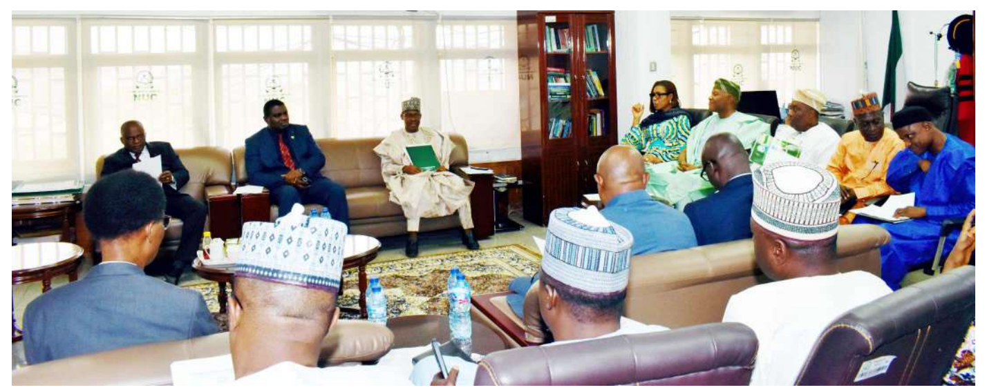
The meeting of the Acting Executive Secretary and some members of his Management team with the NPMCN delegation in session