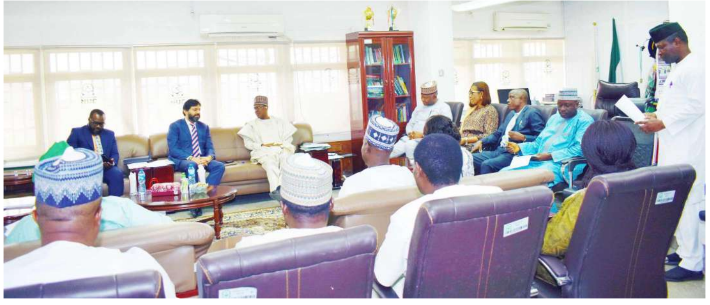
The meeting of the Acting Executive Secretary and some members of his Management team with the Skyline University delegation in session

The guidelines, he said, was backed by six competitive models of delivery which would ensure accurate and effective delivery of knowledge and that only credit worthy universities would be provided with the opportunity to contribute to this course.