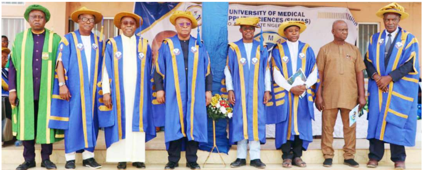
Th Ag. ES, NUC, (4th right) in a group photograph with the representative of the Governor of Enugu State and other dignitaries at the Inaugural Lecture

The Chairman underscored the importance of political decisions in