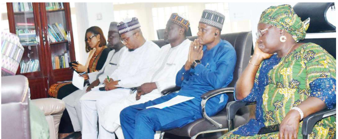
Some members of the NUC Management team at the presentation/visit

Responding, the Executive Secretary welcomed the Daimler Artificial Intelligence CEO to NUC and thanked him for a wonderful presentation, saying that AI resonated for future and it would rejuvenate higher education in Nigeria. He said that, moreover, it was now compelling to put a national policy statement on AI in Nigeria.