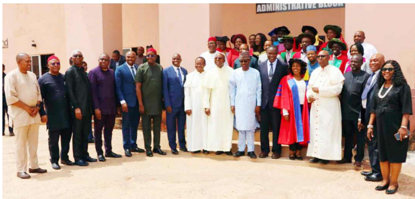
The Ag. ES, NUC (7th right front row) in a large group photograph with other dignitaries, management and staff of the University after the Inaugural Lecture