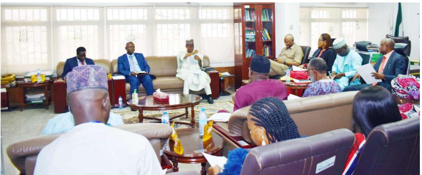
The Ag. ES, NUC, stressing a point during the meeting while members of the management and the visitors were attentive