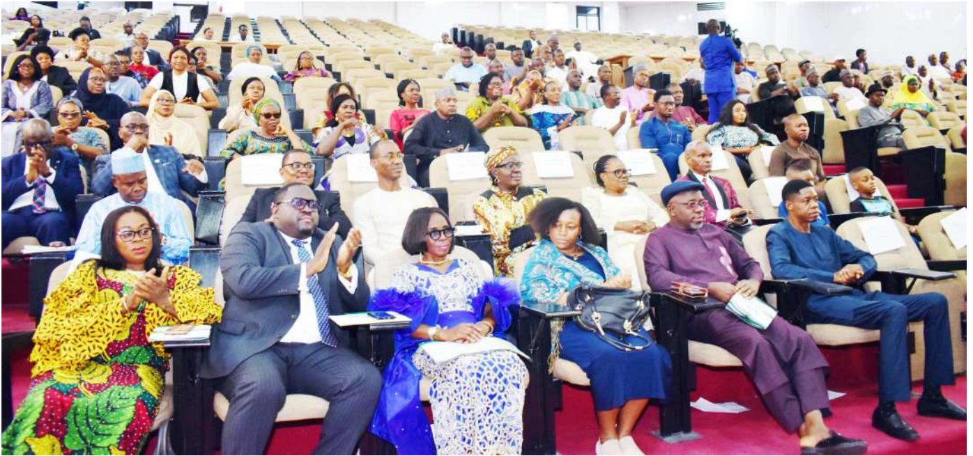
Some of the dignitaries at the ceremony

stringent 14-step selection process was a well-articulated set of criteria and procedures developed by the Commission, over the years, to meet its commitment to, continually, deepen quality and widen access to university education.