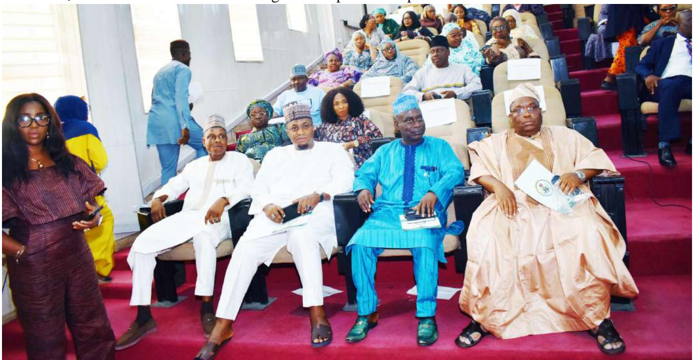
Some members of the NUC Management at the event

He said that it was generally believed that deliberate and result-oriented investment in quality education was a prerequisite for the production of the human capital required to drive sustainable socio-