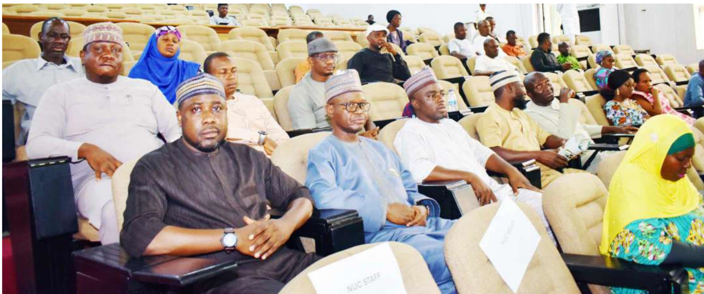
Some NUC staff present at the event