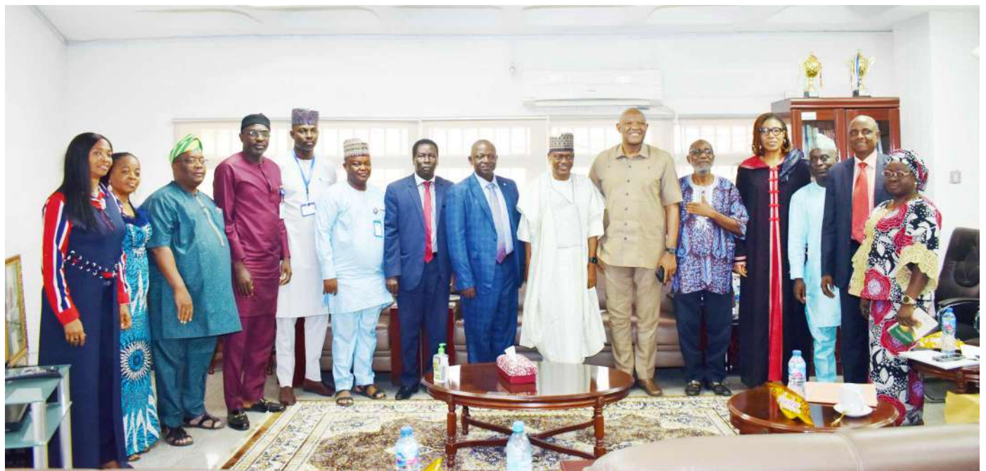
The Ag. ES, NUC (7th right) in a group photograph with the visitors and members of the NUC Management