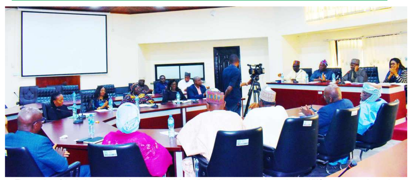
The meeting of the Acting Executive Secretary with Igbenedion University delegation and some NUC management in session

presence of a Federal University, some state had up to four, some three, while others had two and one, as the case might be.