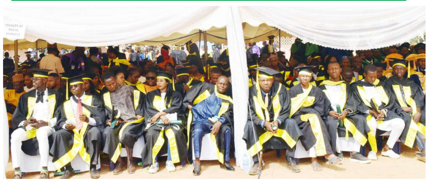
The VC highlighted others as the introduction and mainstreaming of e-learning modality in the programme offered by the university at both undergraduate and postgraduate levels; Reinvention of the Committee System model of university administration and governance; Reformation of the processes and procedures of staff promotion by making them more seamless and