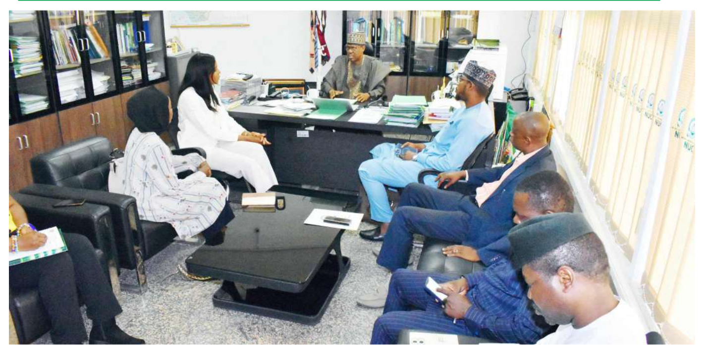
The meeting of the Acting Executive Secretary, NUC with the PNBTI team in session

the interest of the team in education was very welcoming and important, stressing that education brought opportunities to people and no matter what we did as humans, life would always gravitate to education because it remained the bedrock of development, exposure and