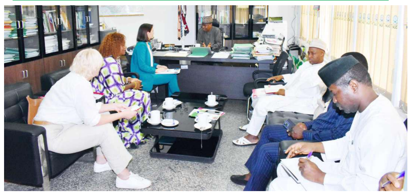
The meeting of the Acting Executive Secretary, NUC with the Sumy State University, Ukraine delegation in session

the University's proposal and intentions in establishing such transnational cooperation with Nigerian universities would be given the necessary support. She assured the NUC management that such educational projects would be mutually beneficial to Ukraine and Nigeria, in providing quality education, under international standards and recognized certification.