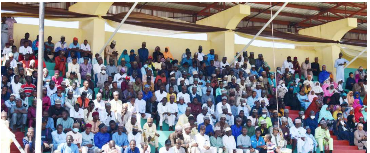
Some of the guests at the convocation

Another highlight of the event was a convocation lecture titled: 'Safeguarding Nigeria's Future: Prioritising Citizens Welfare and Security Amidst Challenges,' delivered by