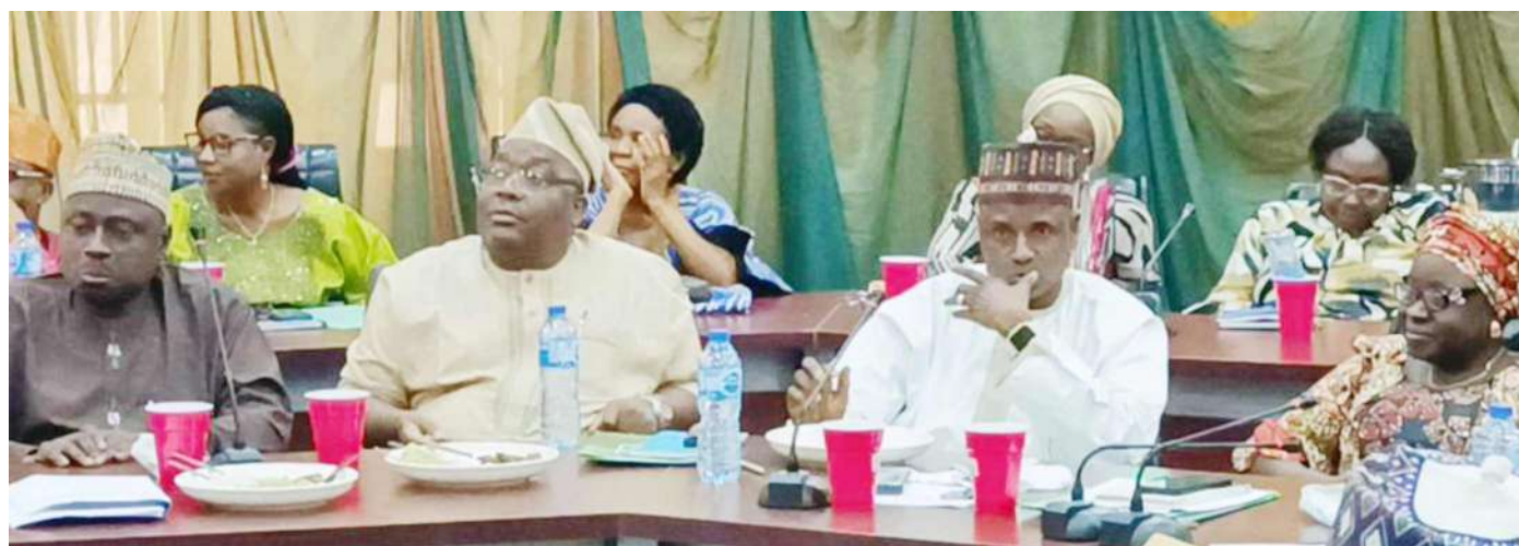
Cross Section of some of the NUC Directors and senior management staff at the ceremony

In attendance were members of the management, the lovely wife of the former DHR and family members, staff, friends and well wishers.