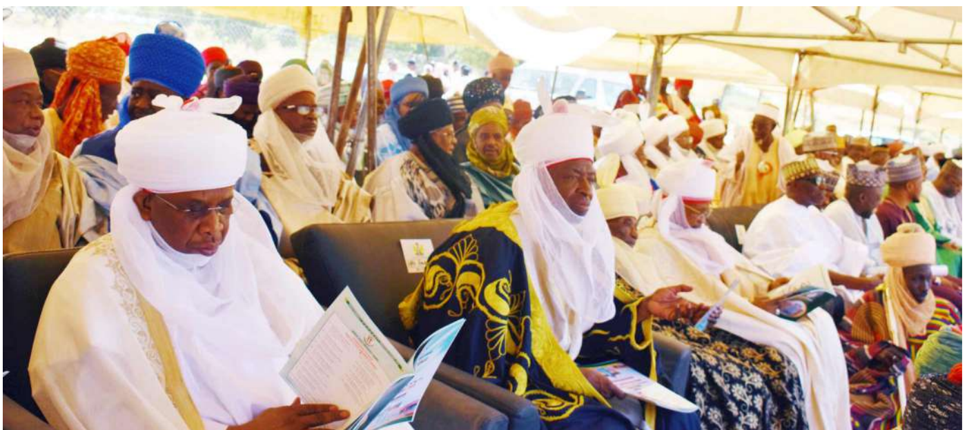
A cross section of Traditional Rulers at the convocation

division represent 42.6 in Second Class Upper Division and 2,368 of them, representing 32.8 percent, graduated with Second Class Lower degrees.