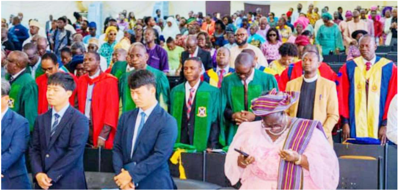
A cross section of the graduands and other dignitaries at the convocation

electrical works and wiring, auto mechanical work, metal works and welding, wood works and carpentry, masonry and block making, creative arts, music recording and sound engineering, computer hardware repair and tailoring.