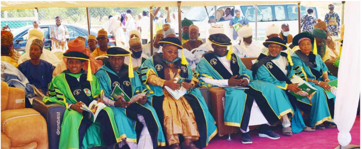
Some of the principal officers of the university