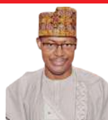
36 Bag First Class @ Ajayi Crowther Varsity 15th Convocation