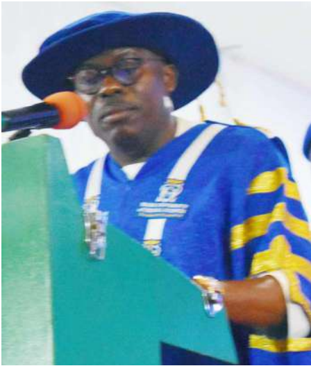
Sir Siminalayi Fubara Executive Governor of Rivers State

for increase in the number in order to cater for the demand for university education.