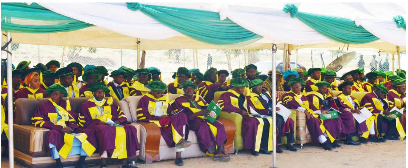
A cross section of the Msc and Phd graduands

He called on the management of the University to continuously engage the State Government on the need to improve intervention for the sustainable engagement of qualified academics for teaching, learning and research.