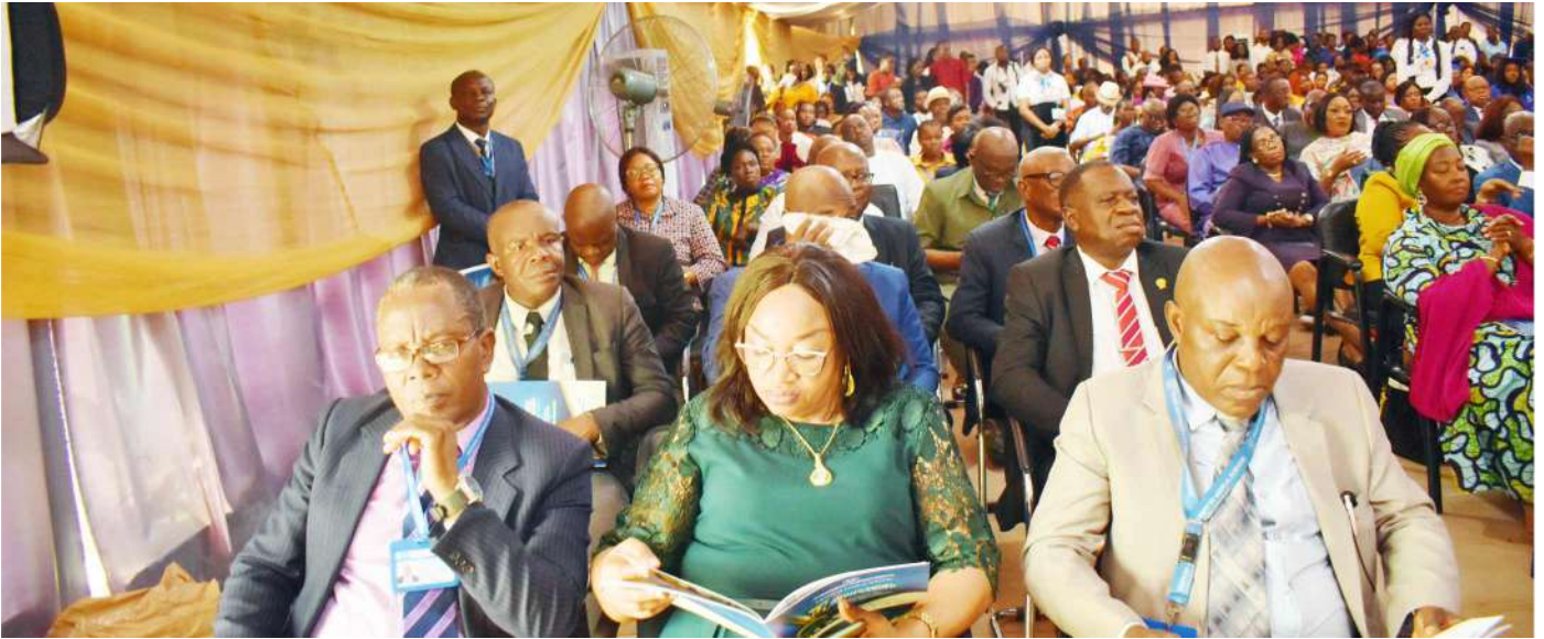
Others at the event

He also commended the Chancellor, Gen. (rtd.) Abdulalami Abubakar for his uncommon humility and for blazing the trail in approving the first set of private universities in 1999 and for selfless service to the nation at large.