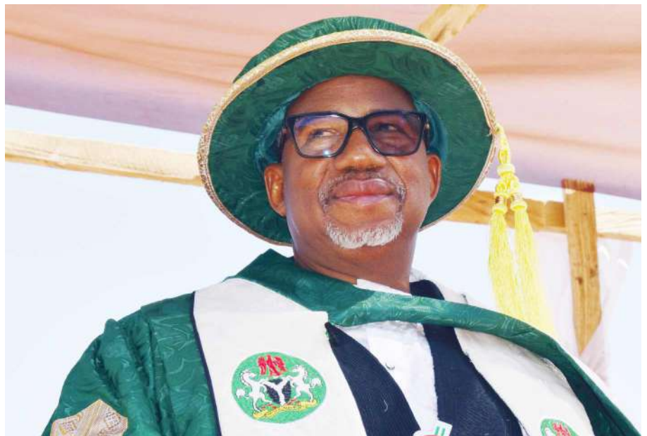
His Excellency, Governor Bala Mohammed The Executive Governor of Bauchi State and Visitor to the University

assured the provision of infrastructure and adequate support to state-owned tertiary institutions to ensure smooth academic operations.