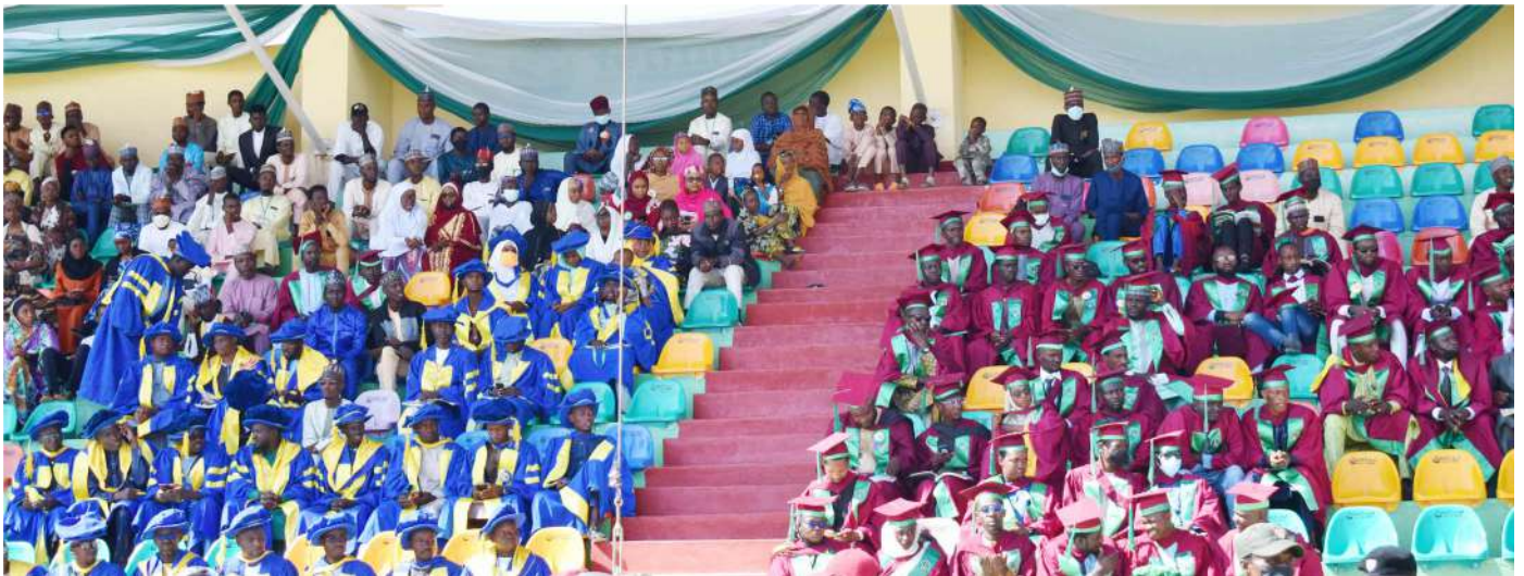
Some of the graduating students from various classes at the convocation