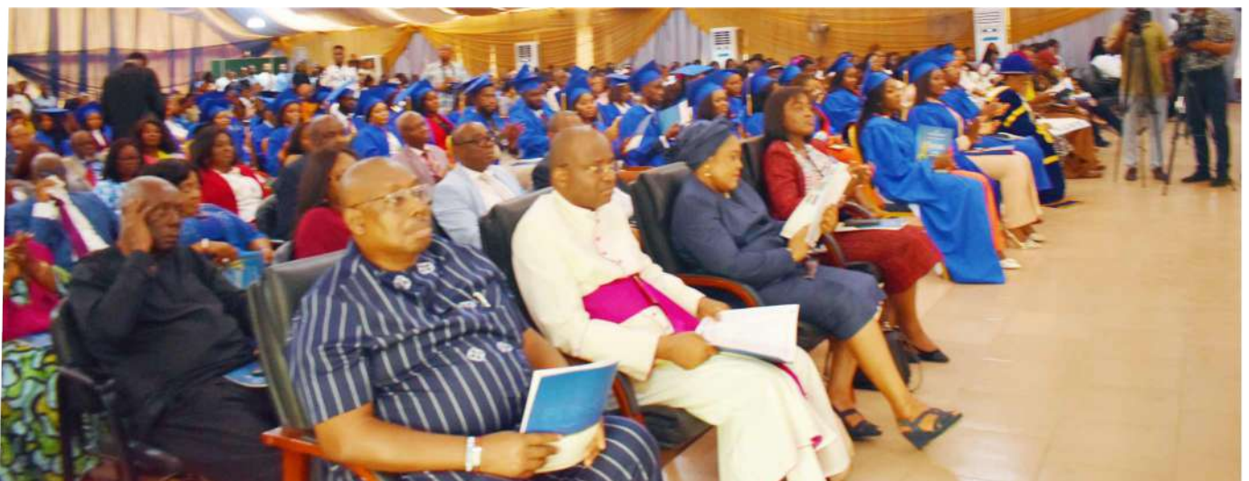
A cross section of some of the dignitaries and Pioneer Graduating Medical Doctors of PAMO University at the ceremony

The former Executive Secretary noted with pride that PAMO was the first private medical university in Nigeria, the first in Port-Harcourt and also one of the best since the last six years of its existence.