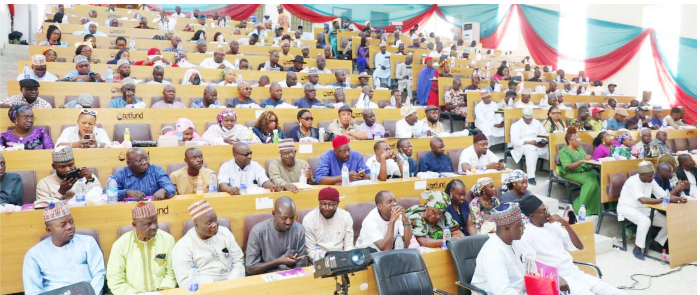
Some of the of SSANU officials at the conference