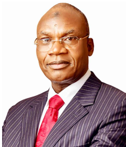
Professor Tahir Mamman The Honourable Minister of Education

against Government other than confrontations, noting that strikes had become old-