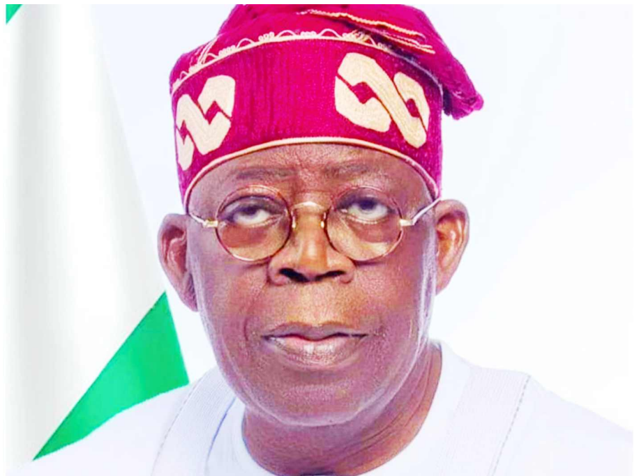
His Excellency Bola Ahmed Tinubu, GCFR President and Commander-in-Chief of the Armed Forces, Federal Republic of Nigeria

sector since he assumed office in the last seven months, including his novel signing of the Students Loan Bill into Law, which, he