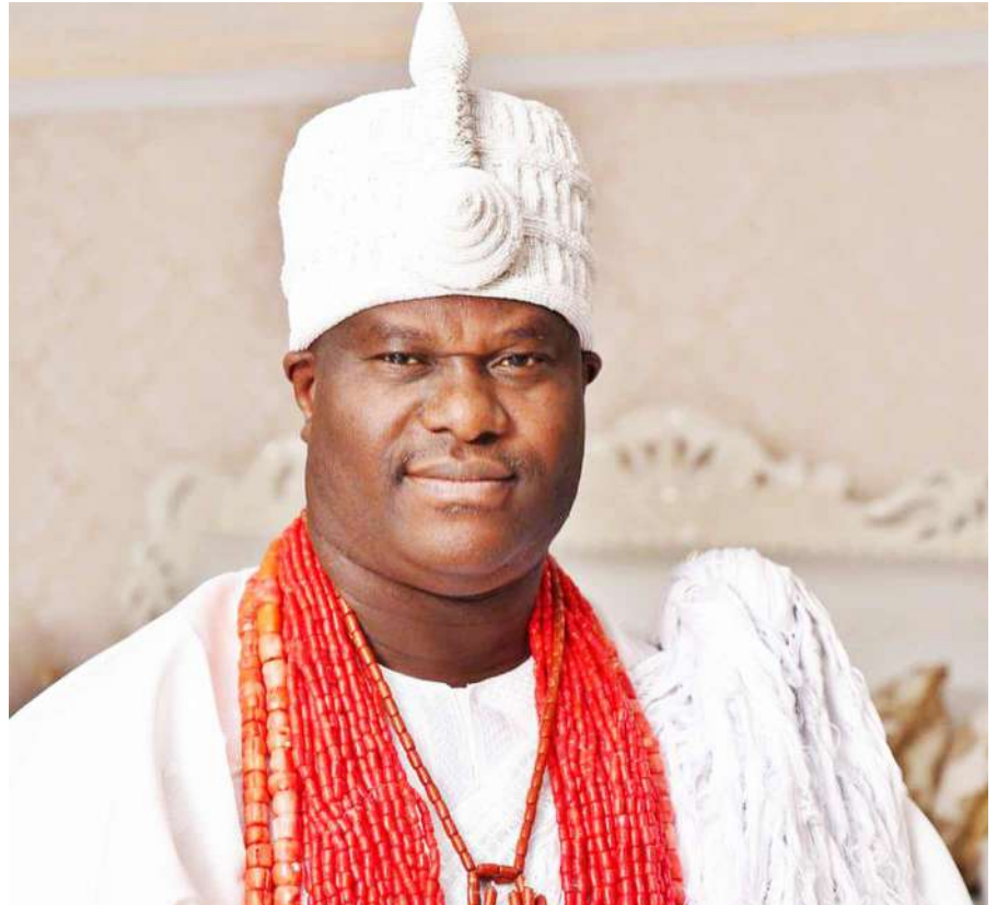
His Imperial Majesty, Oba Adeyeye Ogunwusi The Ooni of Ife and Chancellor, UNN