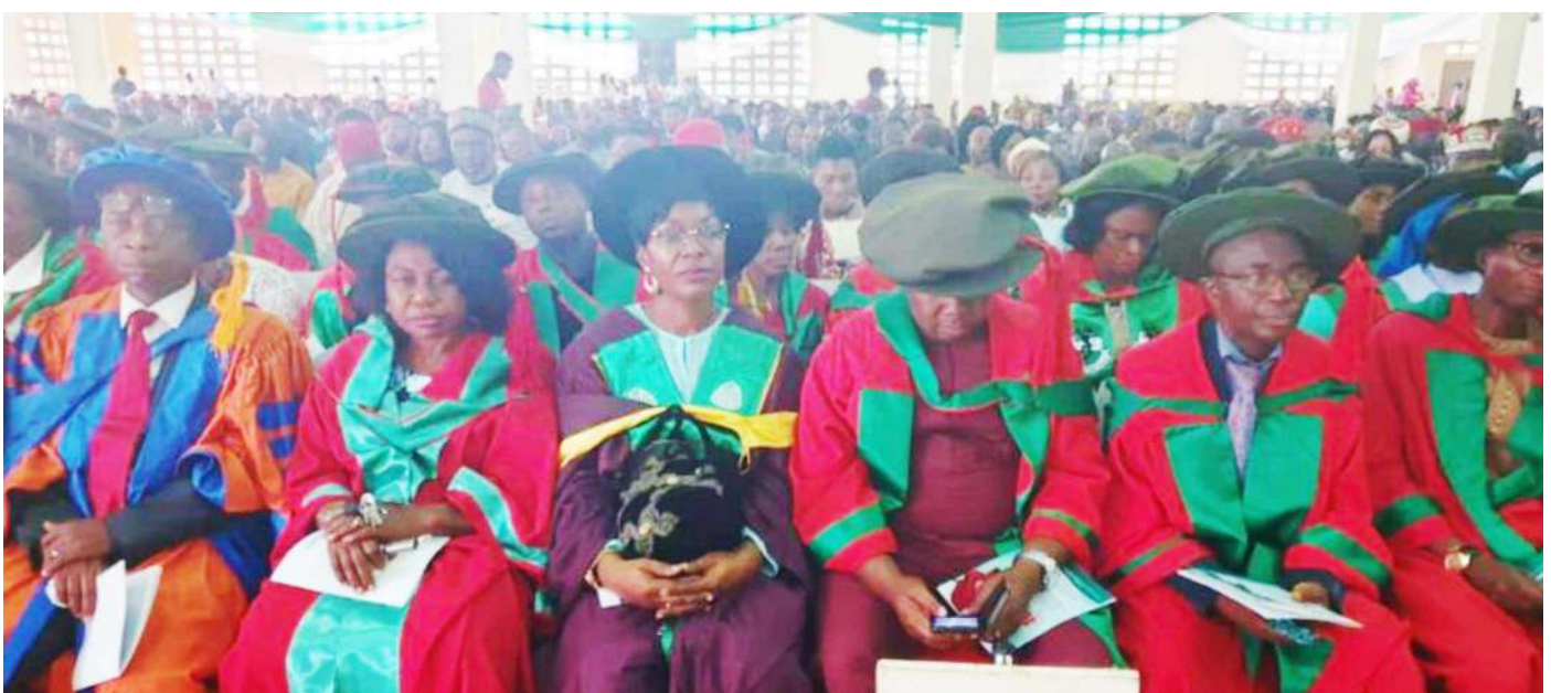
A cross section of the PhD graduands