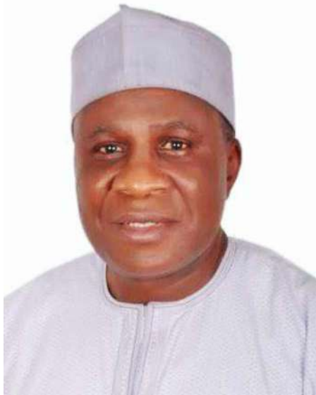
Engr. Abubakar Momoh

The Honourable Minister of Niger Delta Development