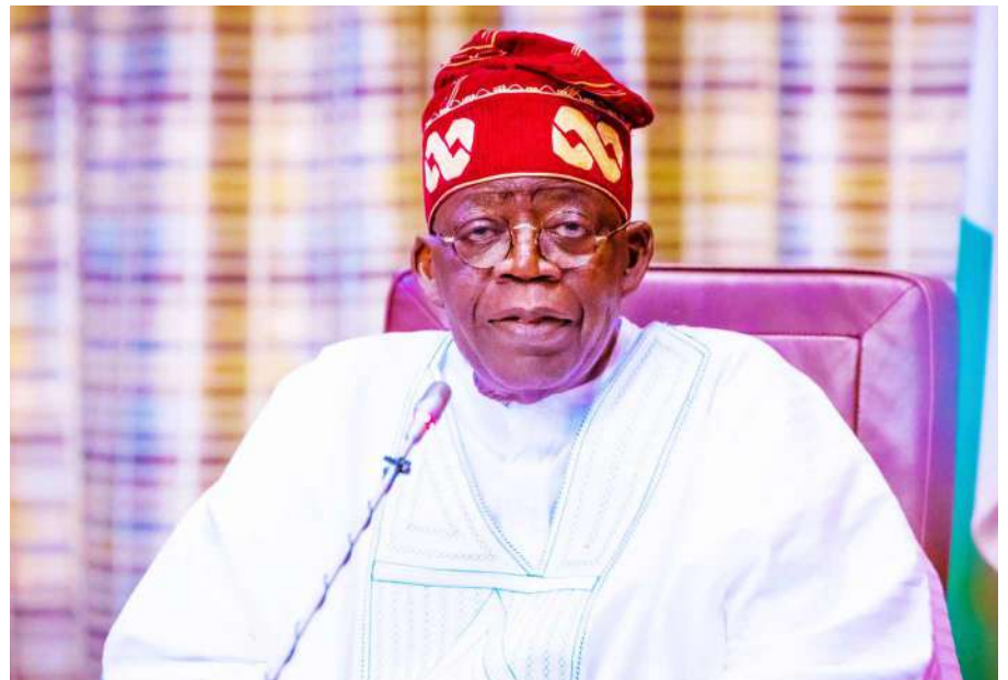
His Excellency Bola Ahmed Tinubu, GCFR President and Commander-in-Chief of the Armed Forces, Federal Republic of Nigeria

of unpaid salaries of all categories of university staff, in particular, members of the teaching staff