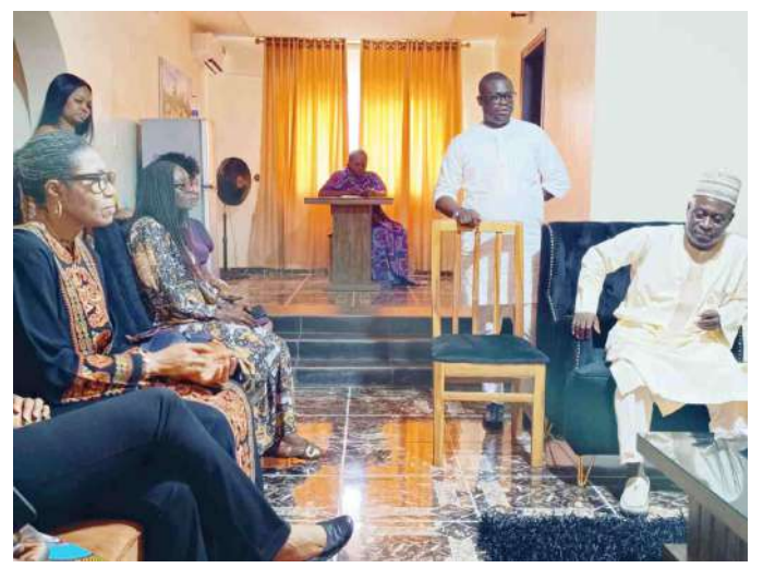
Some NUC Management Staff at the bereaved family's house