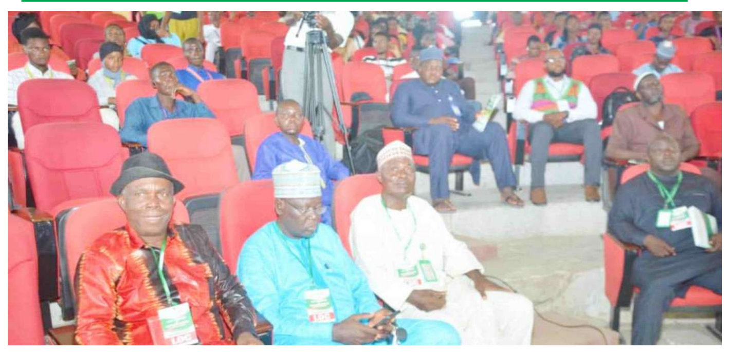
A cross section of participants at the conference

agencies established by the Northern regional government for the purpose of production and distribution of books under state sponsorship and control.