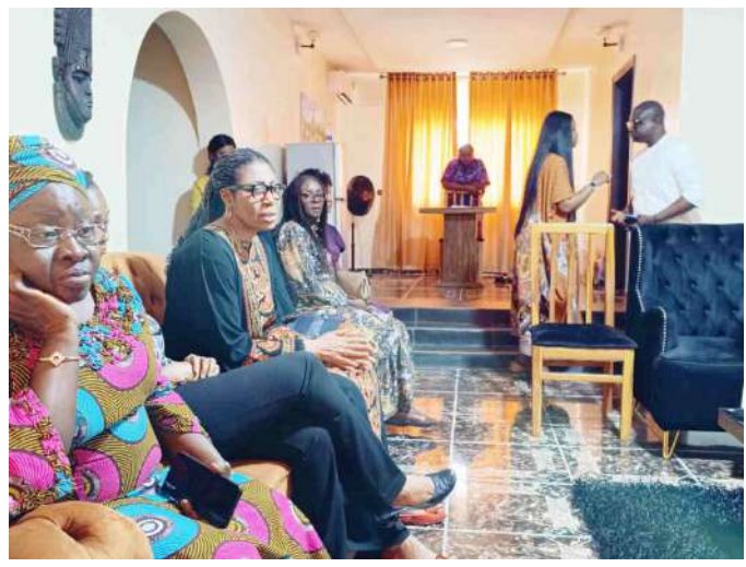
Some NUC Management Staff at the bereaved family's house

MONDAY BULLETIN | A Publication Of The Office Of The Executive Secretary Page 12