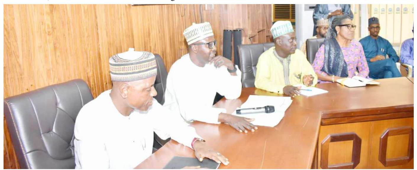
Some Members of NUC Management and the representative of PIC during the meeting

He, therefore, stressed the need to have trained medical doctors and other allied medical practitioners.