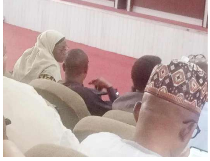
Some Participants at the meeting

MONDAY BULLETIN | A Publication Of The Office Of The Executive Secretary Page 11