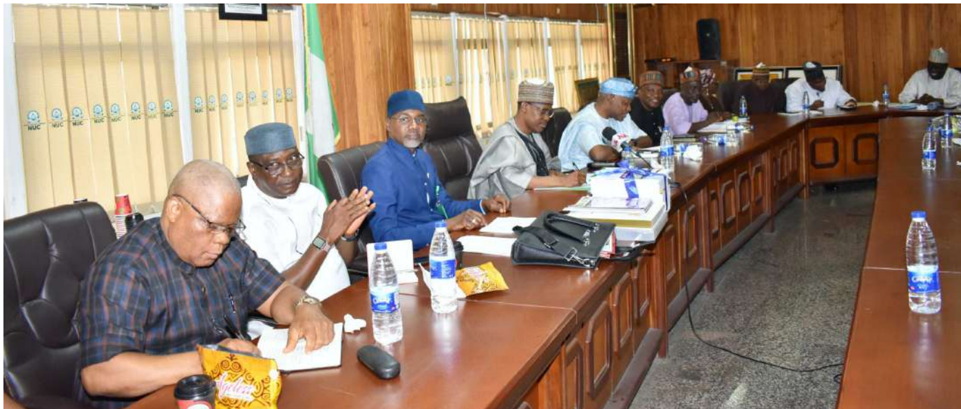
The Meeting of the NUC Management team with FUT, Daura delegation

has the mandate to lay down minimum academic standards, conduct resource verification visits, as well as advise the Government on the establishment of private universities, among