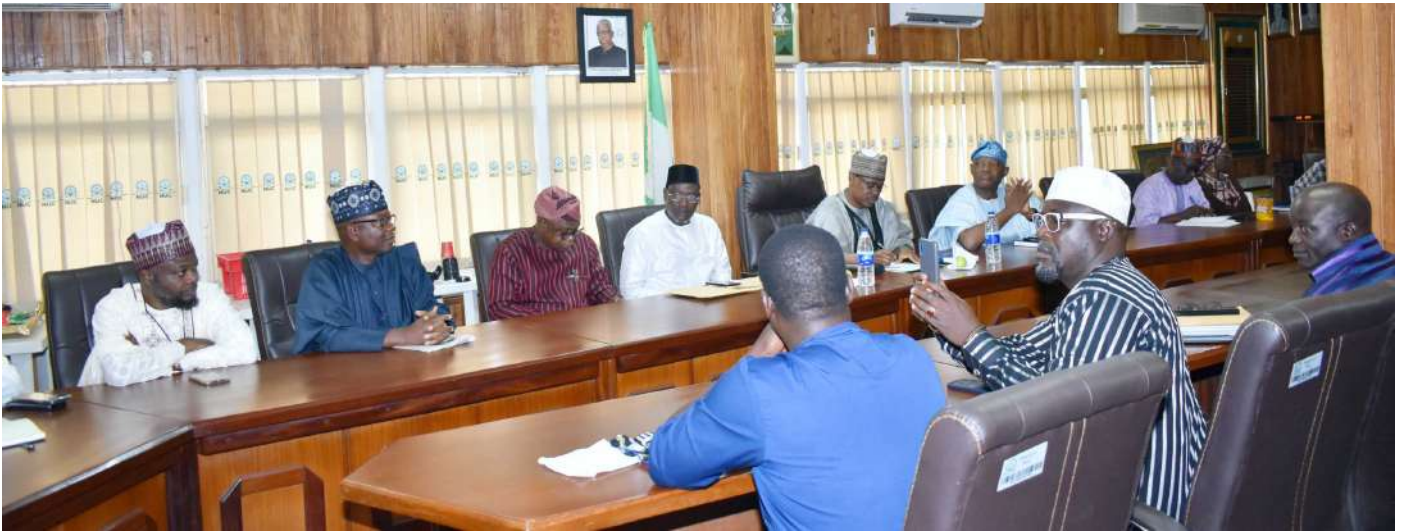
The Meeting of the Acting ES with the Proposed Greenland University Delegation in session

take-off and assured the NUC that the proprietor was willing to work with the Commission to bring the idea for the establishment of the proposed University to fruition.