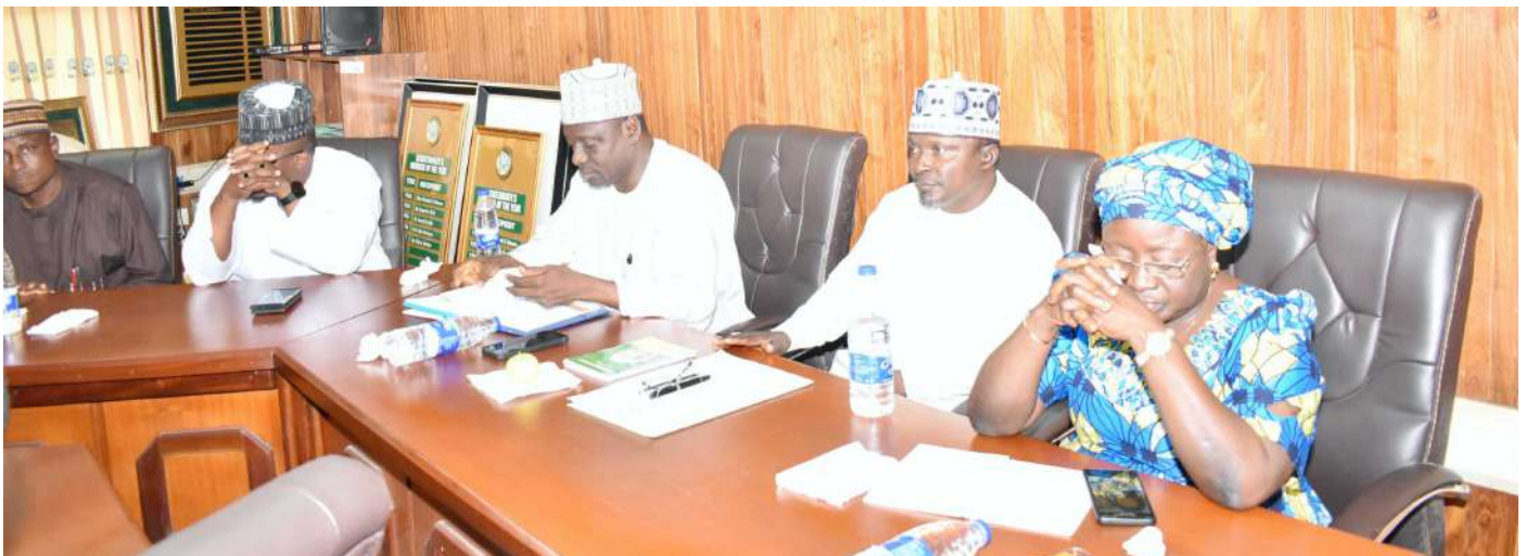
Some NUC Directors at the meeting

He expressed confidence in the personality of the Vice-Chancellor and hoped to work together amicably to uphold the sanctity of quality in the system, saying that