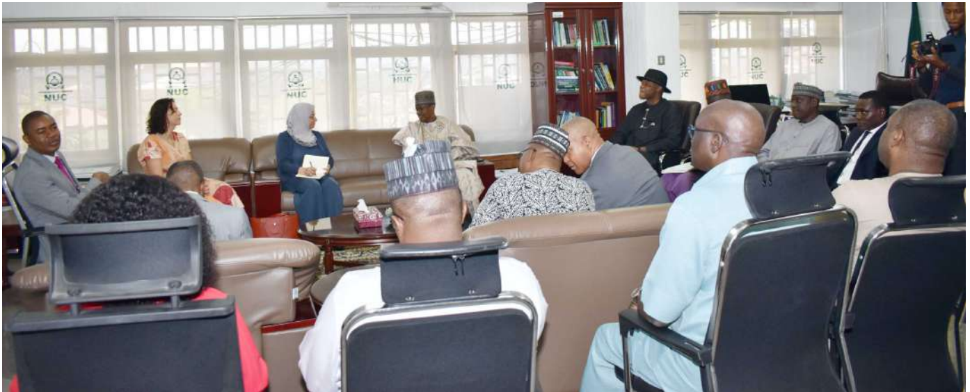
The Meeting of the NUC Management with the World Bank team in session

assistance and untiring efforts geared towards the success of the project.