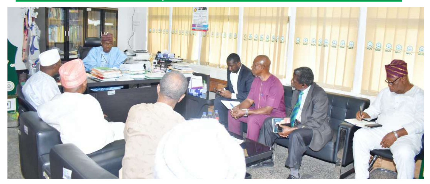
Meeting in session

to pursue their postgraduate studies abroad had excel in their various areas of specialisation and were doing well in other capacities.