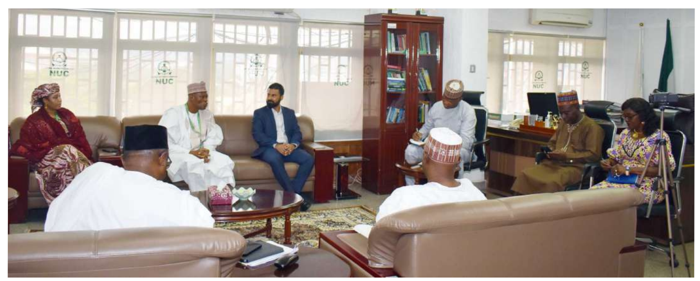
The meeting in session

representative of the Ag Executive Secretary said it was an idea that Nigerian Universities should embrace and specially leverage on the organized philanthropist model as practiced in Indian.