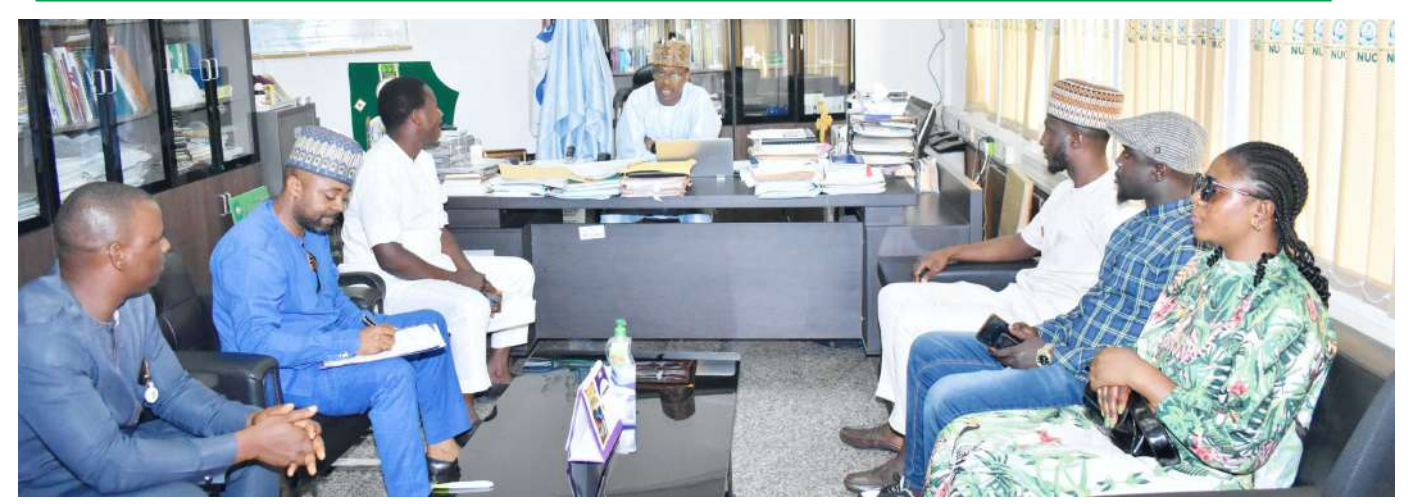
The meeting in session with Plateau Youth Council delegation

He reminded the Ag. Executive Secretary of the teeming youth that had their hopes still high despite all the distractions and trials in the polity, by staying steadfast and seeking available opportunities to be great in Nigeria and had remained ever dedicated, upright and seeking to grow through legal routes.