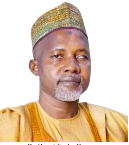
Dr. Yusuf Tanko Sununu Honourable Minister of State for Education

Ministry would continue to leverage on the existing progress and transformation in the development of literacy while setting the stage for lifelong learning of the Nigerian adults and youths. He added that the Ministry would also continue to rethink the fundamental importance of functional literacy as a necessary panacea that would help build resilience and ensure quality, equitable and inclusive education for all.