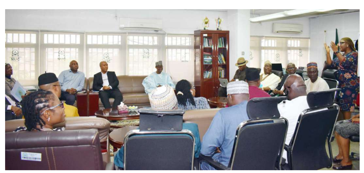
The meeting in session

He added that it was very important for Nigeria to showcase what it had achieved in procurement, environment and the social standard sectors for the world to see.