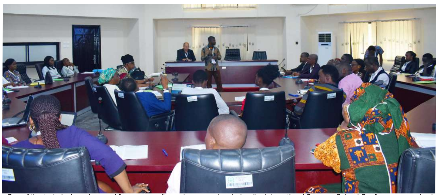
One of the technical sessions and focus group discussions on-going during the International Summer School Conference organized by ACCESS in partnership with NUC.

He suggested that higher institutions must recognize the critical role of employers as the receiver of their products and should be willing to collaborate for mutual benefit.