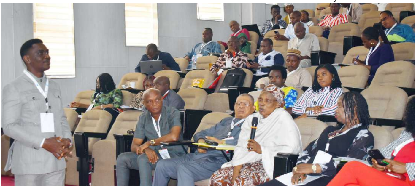
One of the participants commenting on the keynote speech, while others watch with keen interest during the technical session

He also advocated that the alignment of education with industry needs would allow higher institutions to tailor their curricula, training programs, and research with the actual needs of the job market.