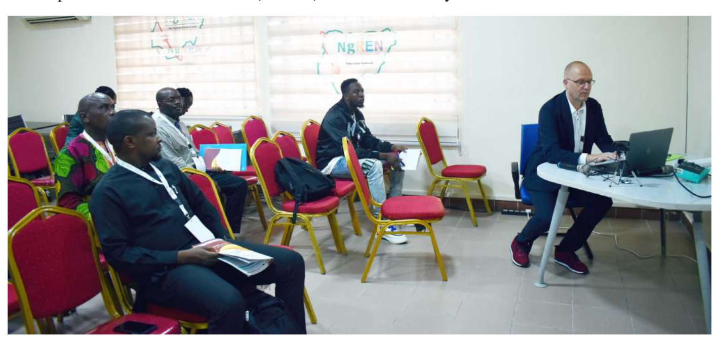
Other Parallel Group Discussions on-going at the Conference

Goodwill messages were delivered by representatives of the Nigerian Directorate of Employment (NDE); International Labour