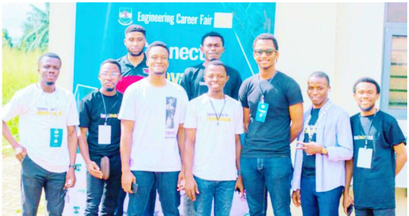
The UNN Faculty of Engineering Students at the Engineering Career Fair hosted by Clintonel Innovation Centre Aba

The UNN Engineering Career Fair was implemented as part of the Engineering Program for Safety and Industry (EPSI), a project supported by Engineering X, an international collaboration founded by the Royal Academy of Engineering UK and Lloyd's Register Foundation.