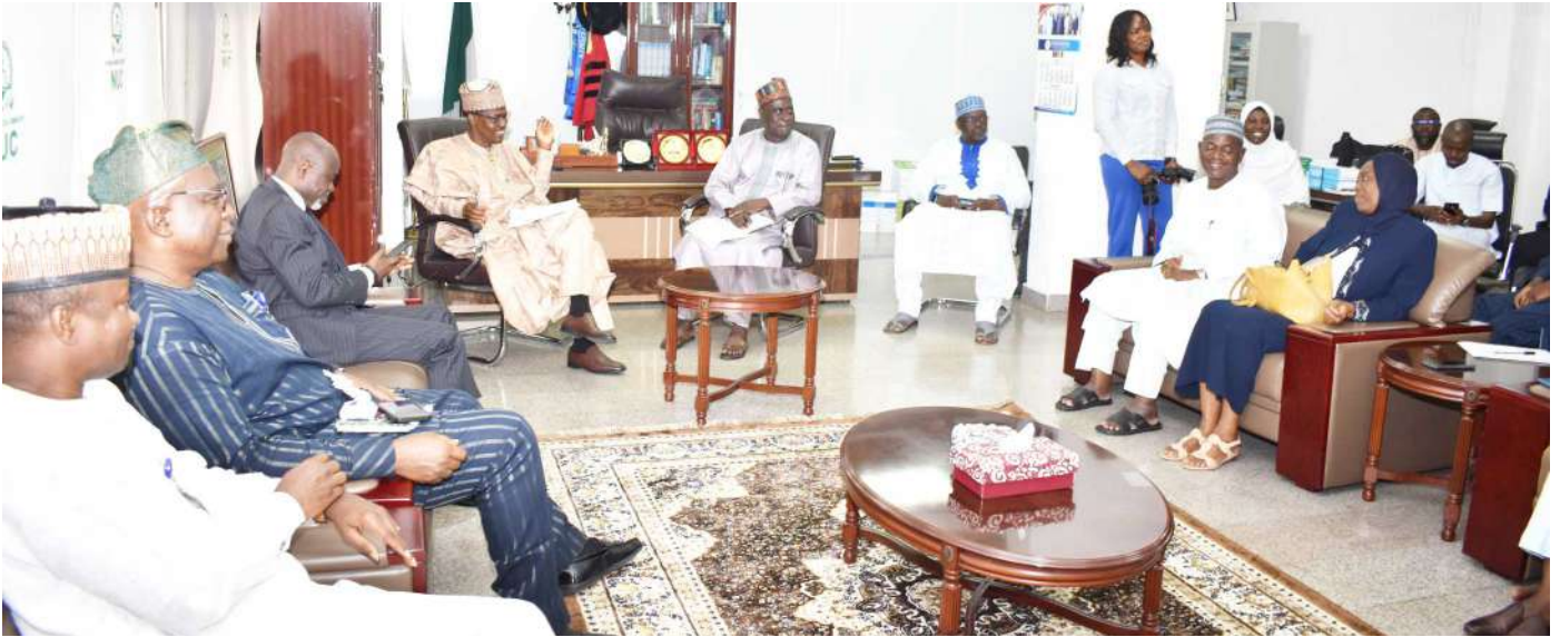
The meeting of the Acting Executive Secretary and his management with the Consortium of Kwara Universities in session

He explained that 10 Universities constituted members of the consortium and their main purpose centred around collaboration and exchange of ideas with each other so that all of them could benefit and be at par in thinking and action.