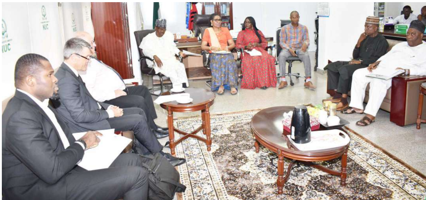
The meeting of the Acting Executive Secretary and his management with the UNICAF delegation in session