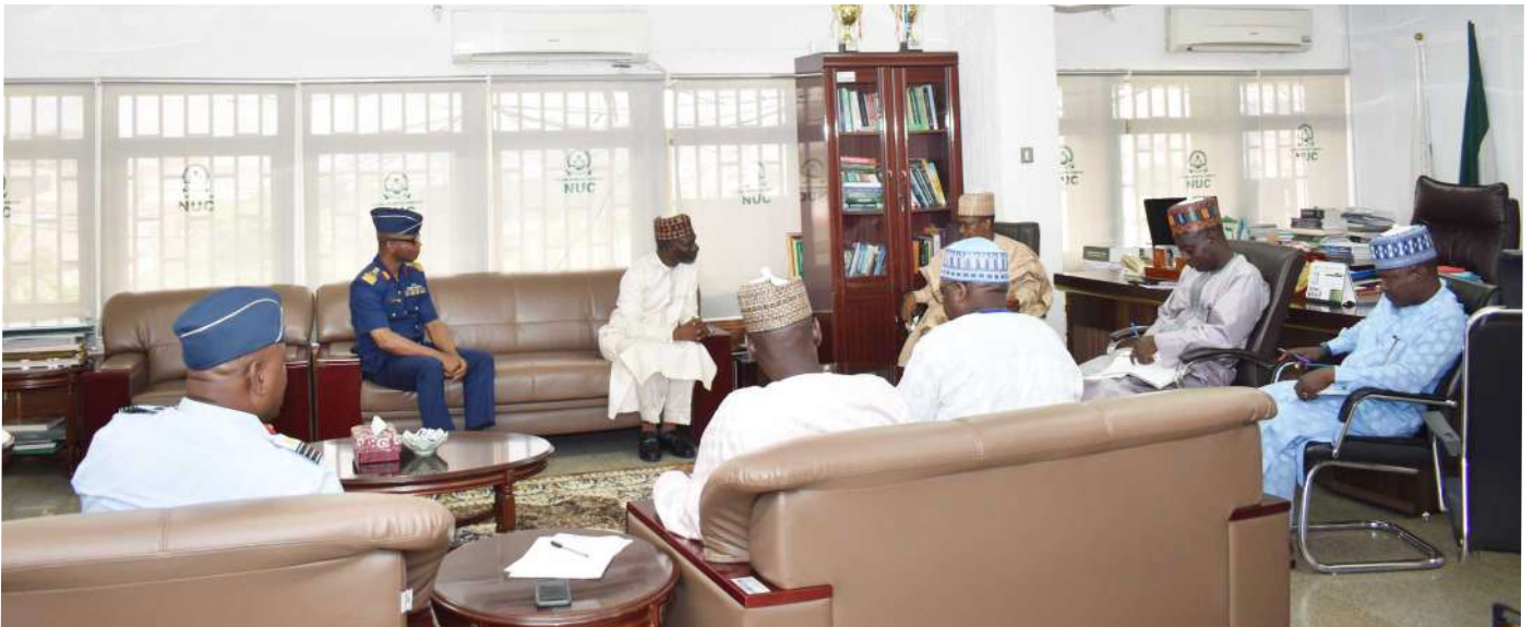
The meeting of the Acting Executive Secretary and his management with the AFIT delegation in session

would never rest on its oars in seeking long lasting solutions to the issues bedeviling the Nigerian Educational System.