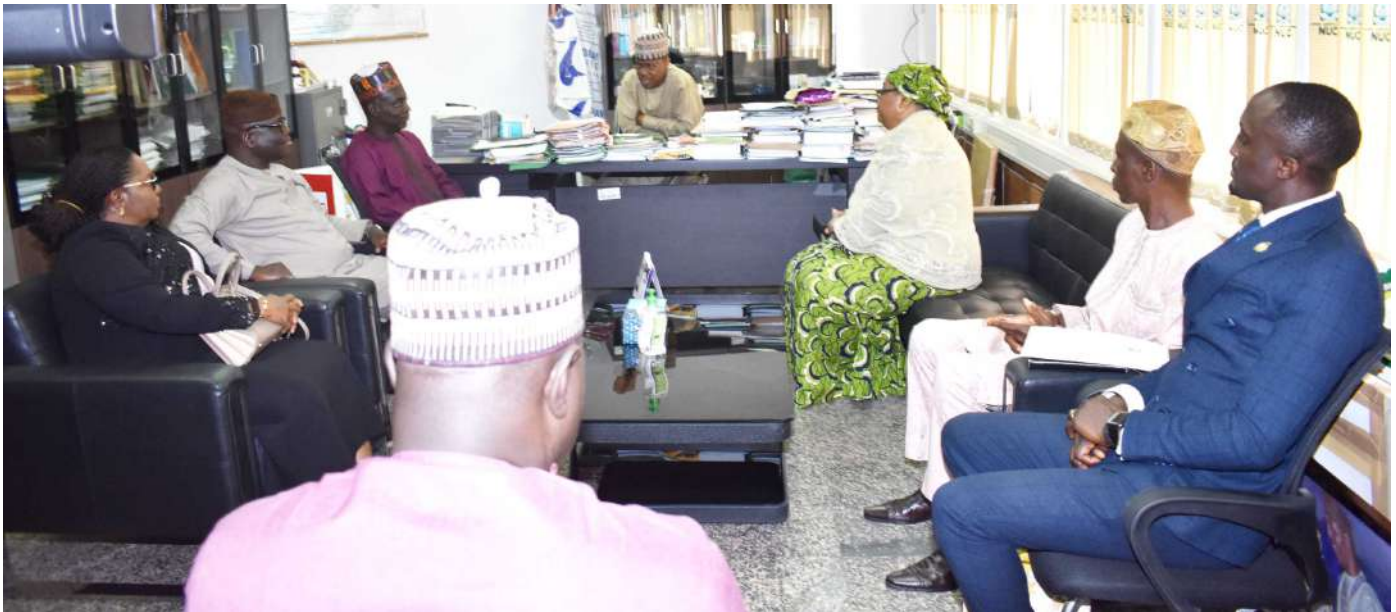
The meeting of the Acting Executive Secretary and his management with the NYSC delegation in session

nostalgia that his service year was eventful as most of his friendship today cuts across people he met during his service year such that one of his close friends left the child in his custody to take to another destination.