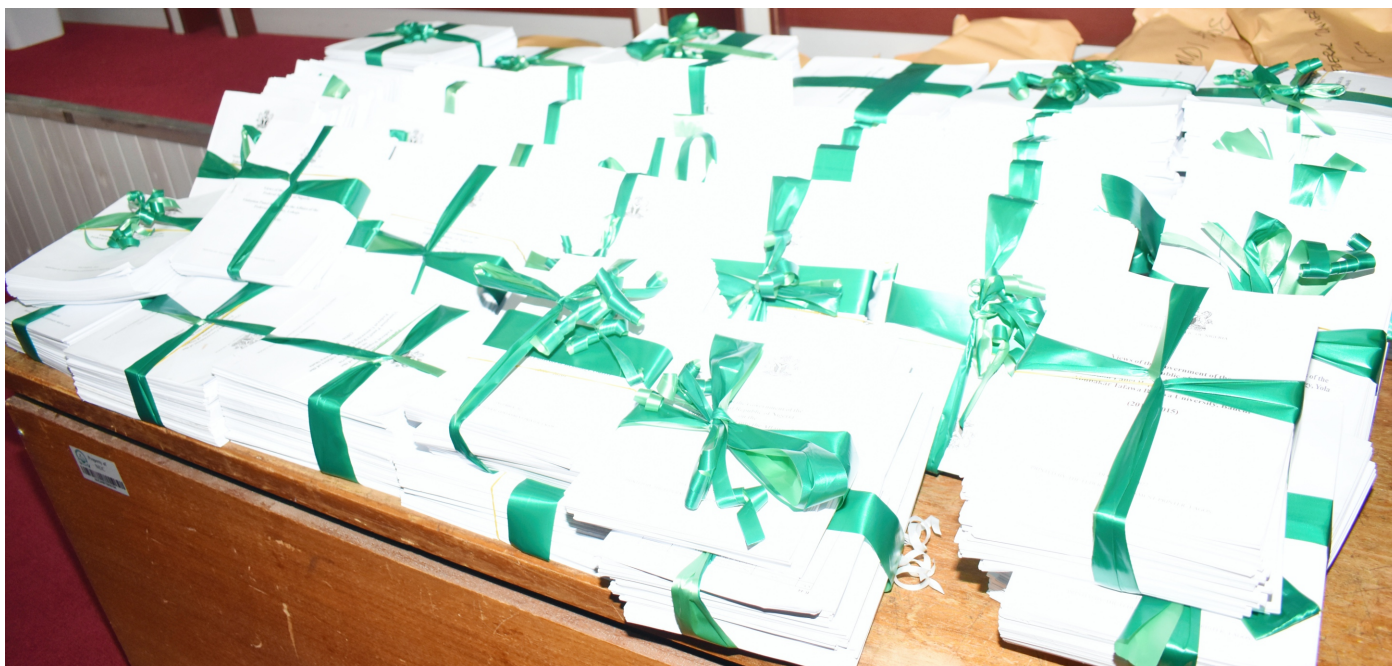
Sample copies of the White Papers on display

Every four years, the President, as a visitor to the federal universities, appoints panels to visit the universities, conduct comprehensive reviews, and report on their activities, including their Internally Generated Revenues (IGR),