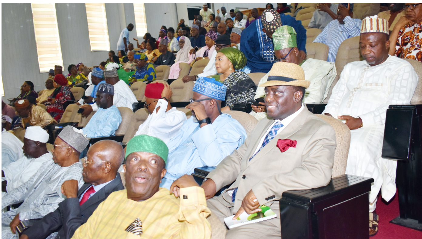
A cross section of some Chairmen of Council of Nigerian Universities and members of the visitation panels to Nigerian Universities