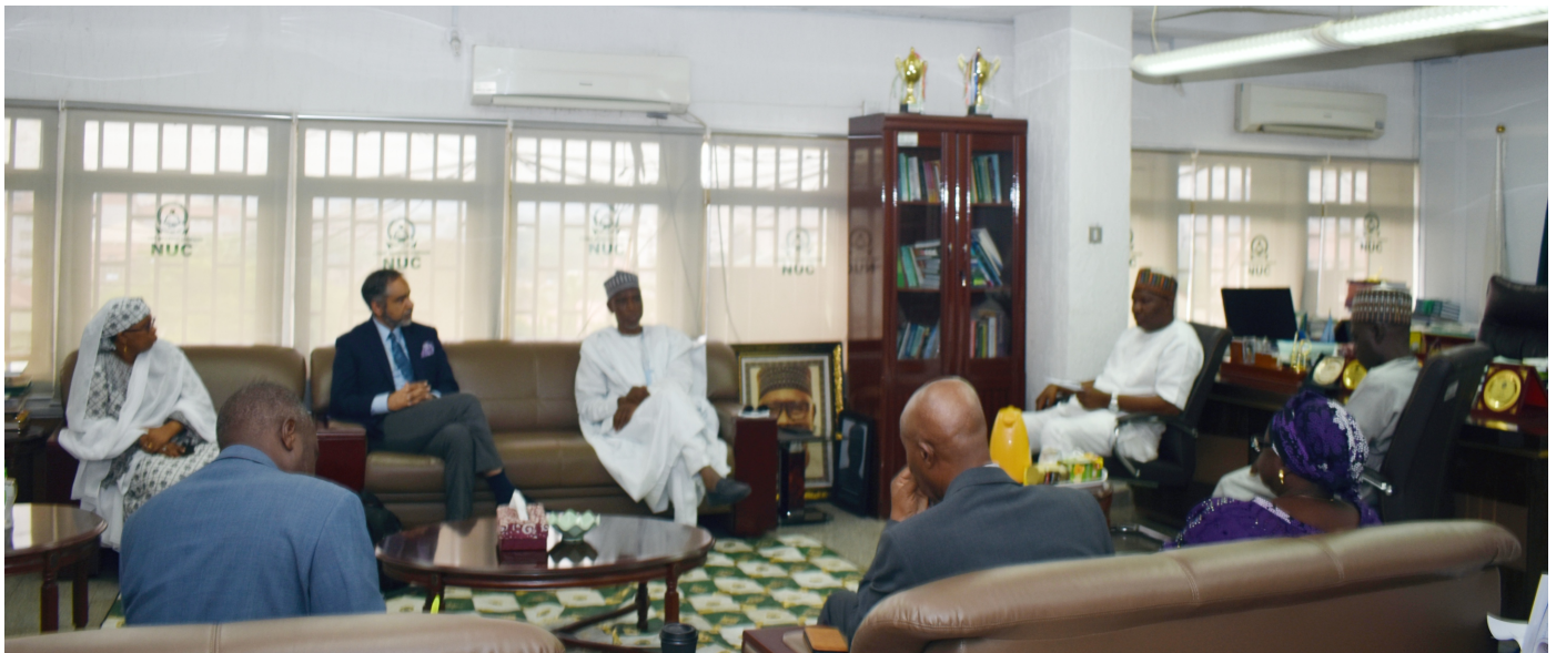
The meeting of the ES with the Institute of Humanitarian Studies delegation in session