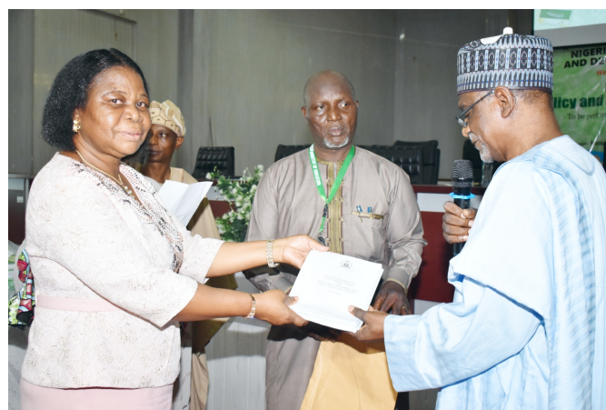
... presenting copies to one of the Pro-Chancellors of a Federal College of Education