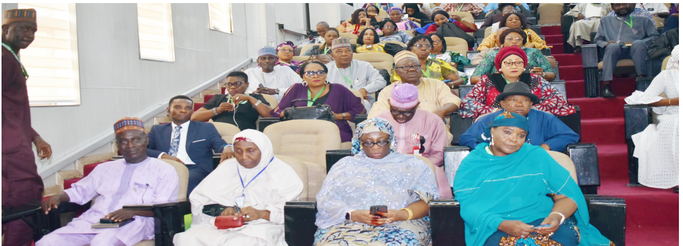
Some of the Participants at the event