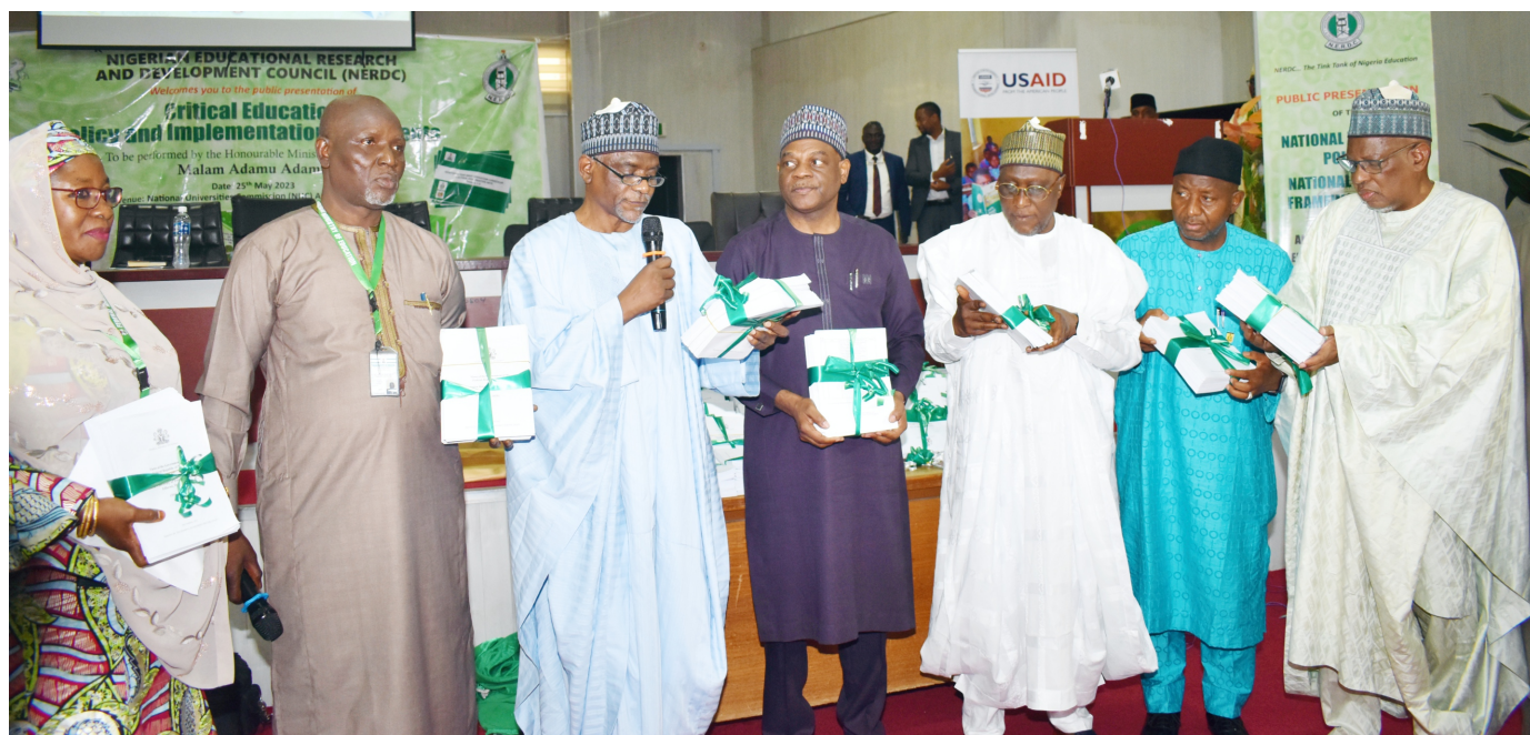
The Minister and ES, TETFund (3rd and 4th left) with some other dignitaries unveiling the White Paper to the public

management of the institutions, compliance to procurement laws, and investigate the application of funds particularly the special grants and loans made for specific projects, among others.