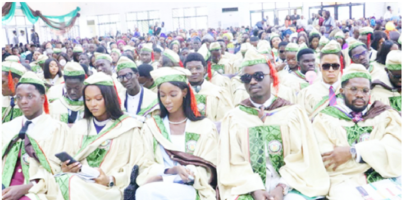
A cross section of the First Degree graduands

At the convocation were some government functionaries, Some Lord spiritual and temporal, friends of the university, Vice-Chancellors of sister institutions, academia, staff and students as well as guardians and wards of the graduands.