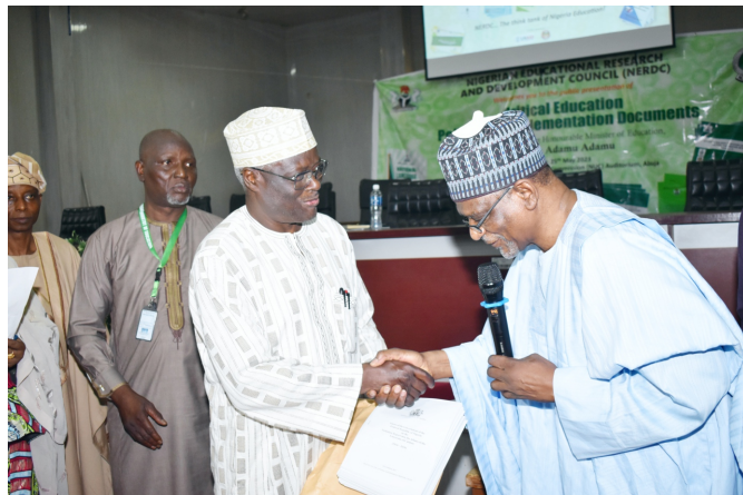
... presenting copies to the Pro-Chancellor, University of Calabar, General (rtd) Martin Luther Agwai