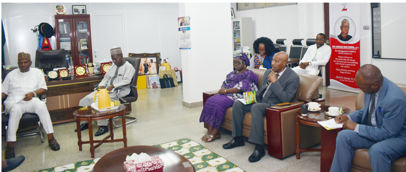
Some of the NUC Directors and visiting officials at the meeting

services as well as produce experts with knowledge and skills in humanitarian work.