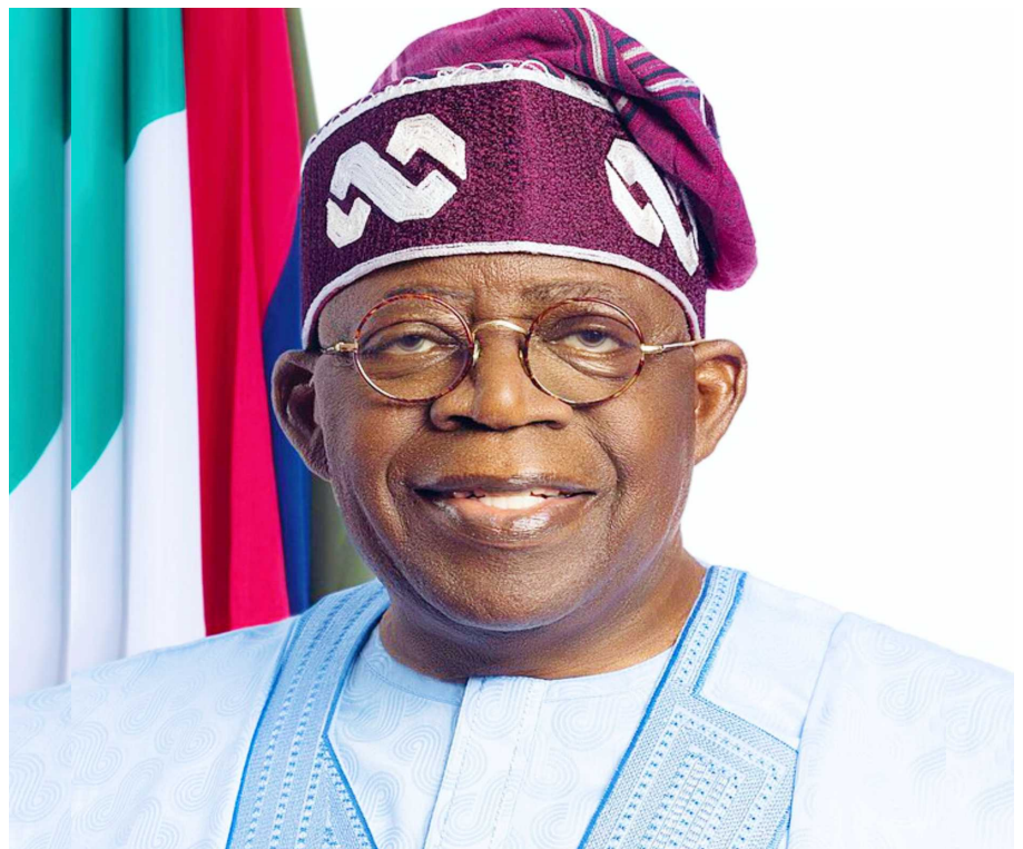
His Excellency, Asiwaju Bola Ahmed Tinubu, GCFR The President and Commander-in-Chief of the Armed Forces of the Federal Republic of Nigeria