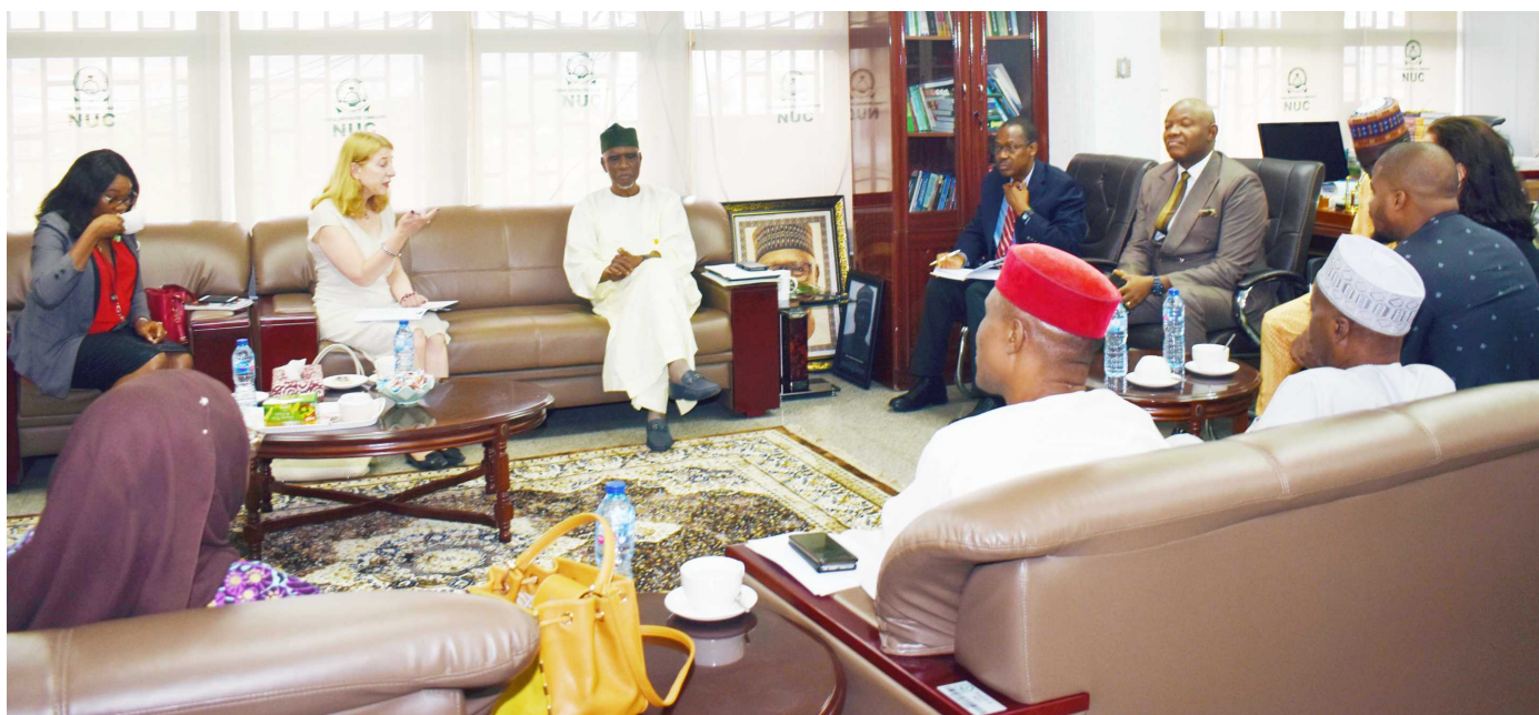
The meeting of the Executive Secretary and his Management team with Swedish Embassy Delegation in session

address the digital entrepreneurship skills in Nigeria by delivering digital learning to the youths through modern ways of learning. She advised NUC to help students go beyond vocational to digital skills so that the students could be competitive in the global market economy. In the past two years, the Global Wissen Consult collaborated with some universities and implemented a digital