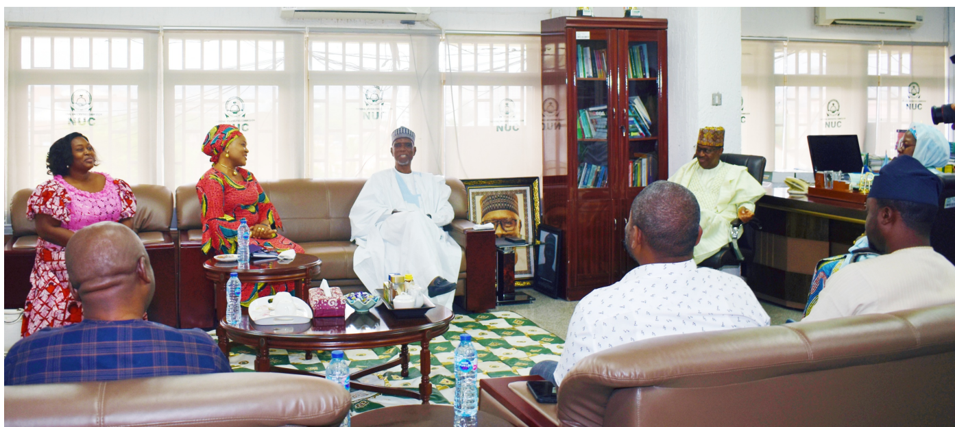
The meeting of the Executive Secretary with the Benue State Wife's Entourage in session

She also explained that her foundation has given out 320 JAMB/UTME scholarships to high school students to enable