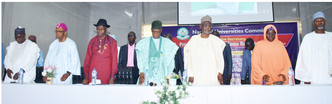
Mallam Adamu Adamu leading others to observe one minute silence in honour of the two fallen heroes of the NUS