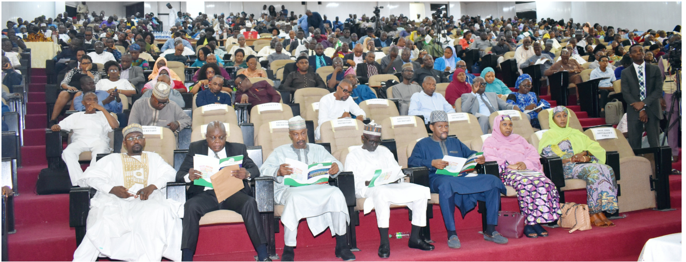
Some of the Participating Universities Staff at the Capacity Building Programme for Implementing the CCMAS