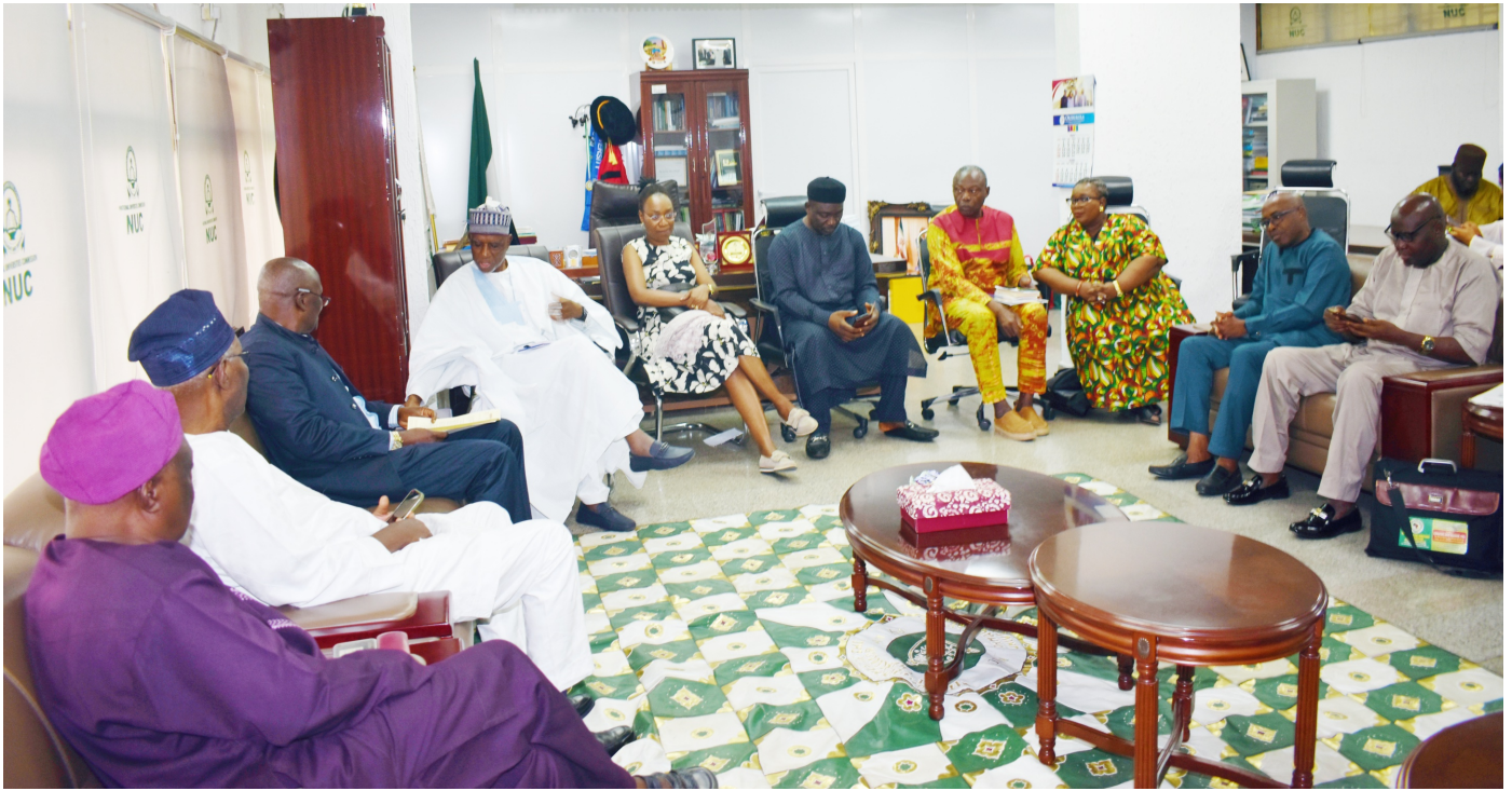
The meeting of the Executive Secretary with the NAL delegation ongoing

activities towards assisting the Nigerian citizens.