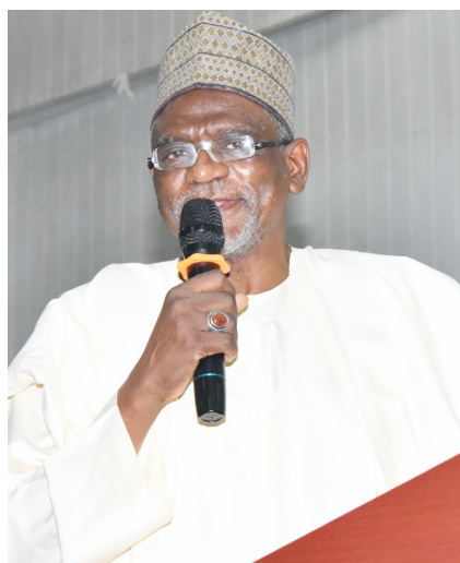
Malam Adamu Adamu Honourable Minister of Education

to take advantage of the training programme to equip themselves with the needed skills and by so doing transfer the knowledge