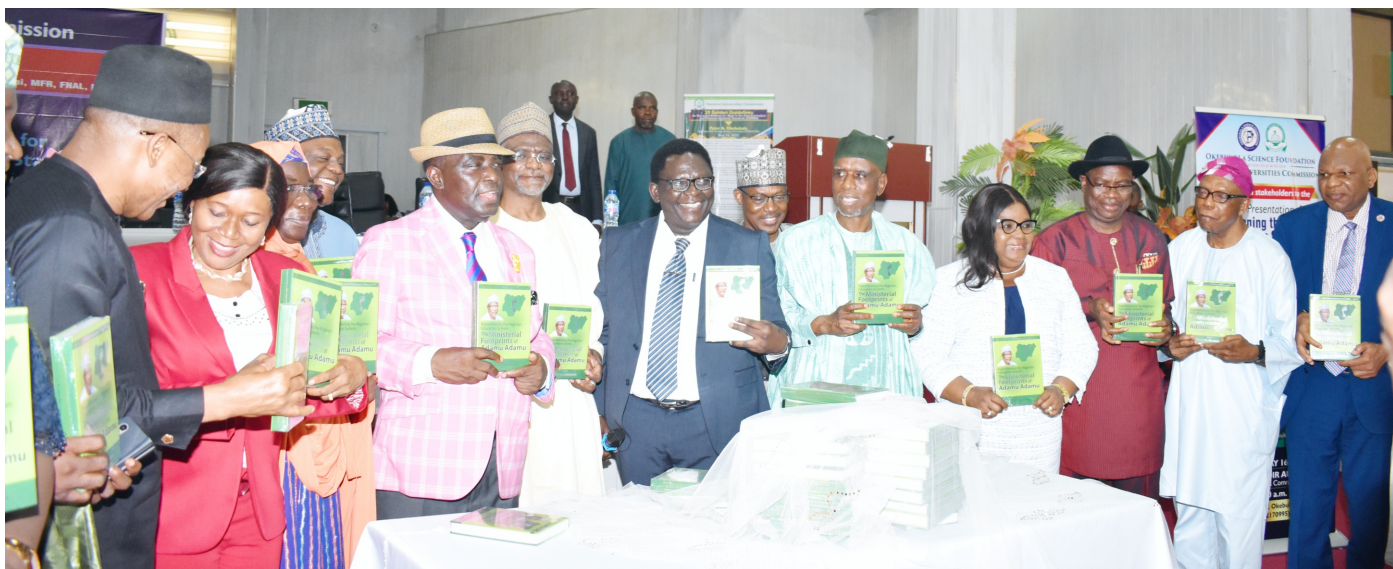
Dignitaries at the High Table Unveiling the Book written in honour of the Minister of Education, Mallam Adamu Adamu

stating that posterity would be kind to all for their commitment to the task.