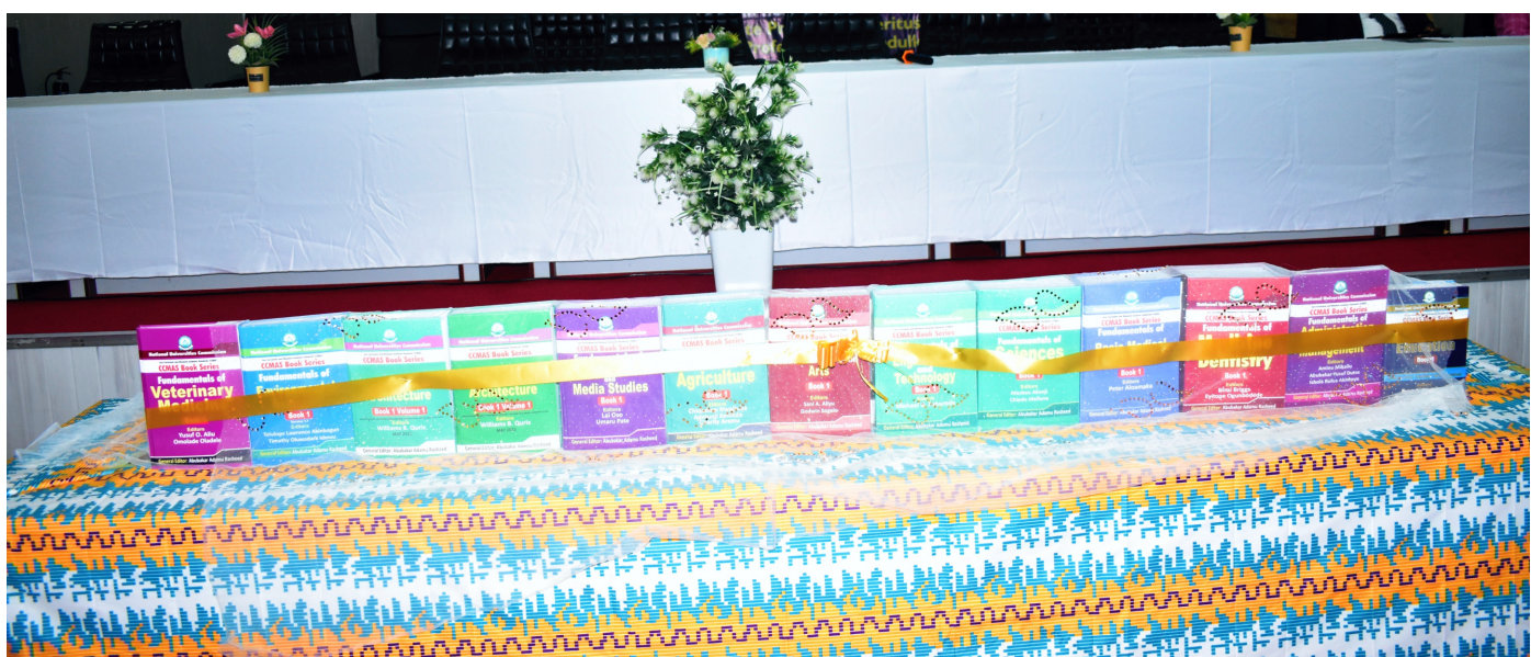
Aerial view of copies of the CCMS for the 17 disciplines of the NUS