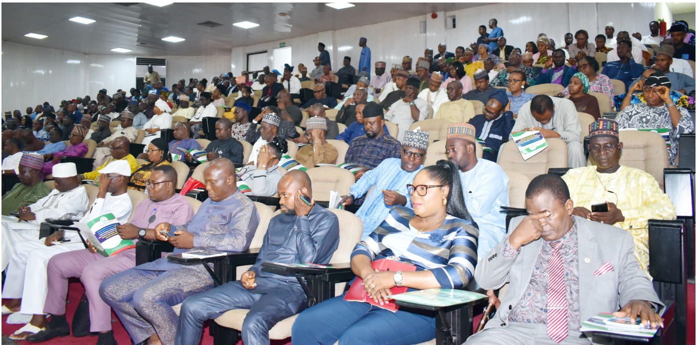
Other Participants at the Capacity Training Programme