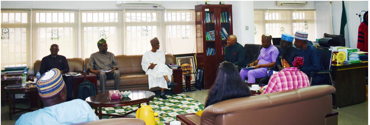
The meeting of the Executive Secretary with the NINLAN delegation in session