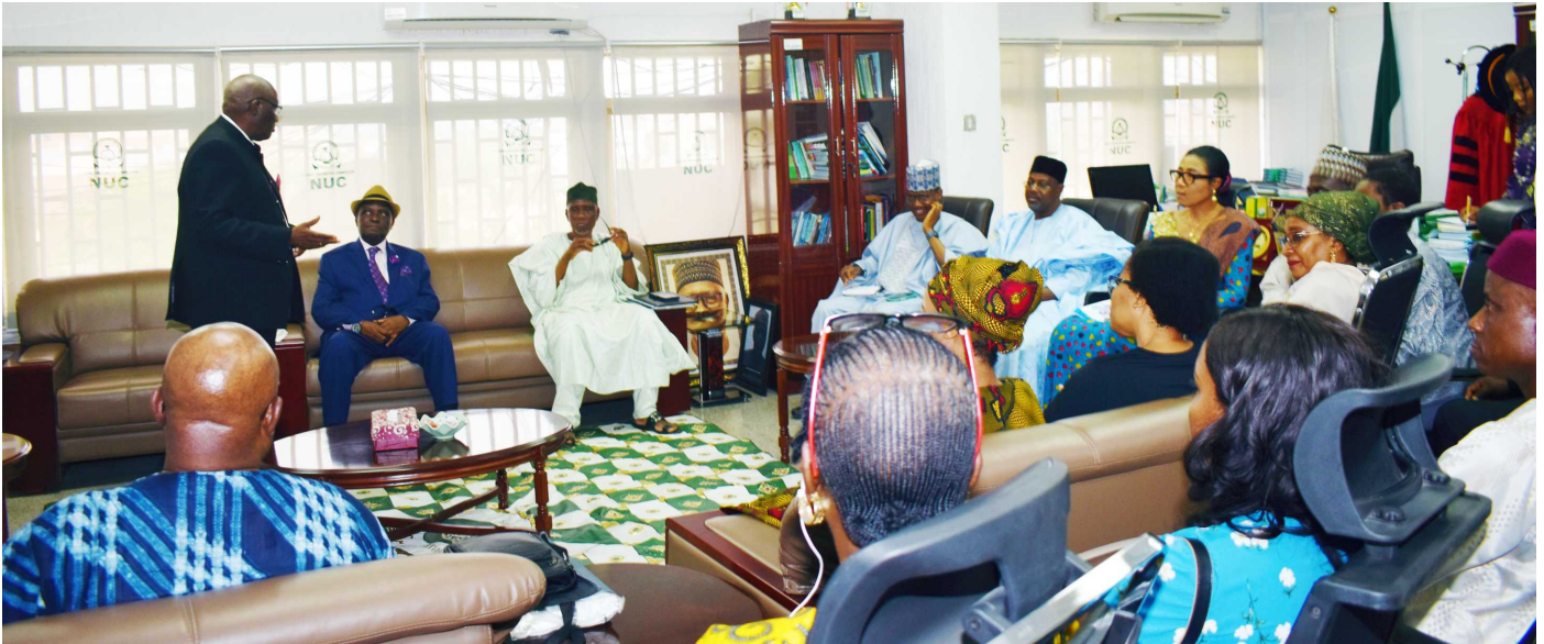
The meeting of the Executive Secretary with the NOUN Council delegation in session

Learning (ODL) institution in Africa and the largest standing dedicated Open Distance Education (ODE) University in the world. He informed the