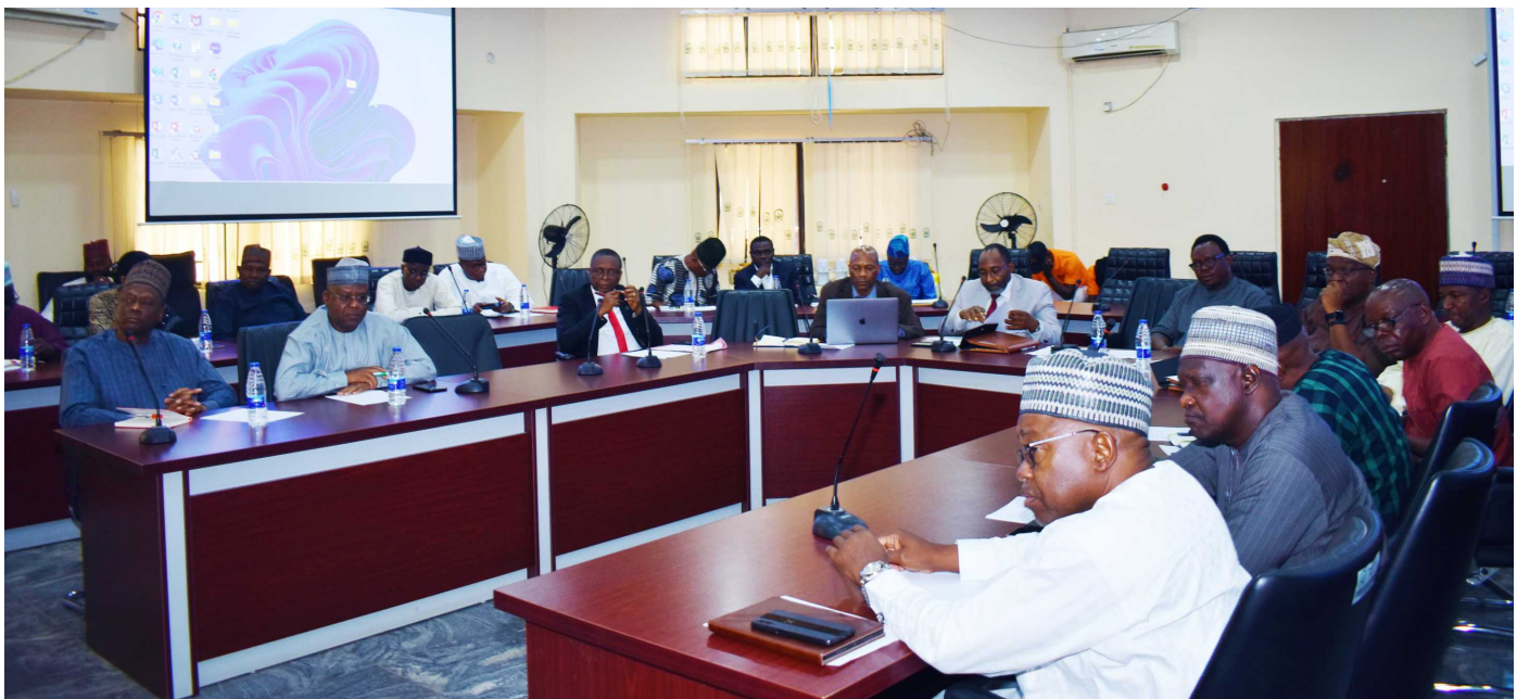
Some of the Vice-Chancellors of Nigerian Universities at the presentation by the Executive Director, Midstream & Downstream Infrastructure Fund (MDGIF)

collapse, adding that the plant could be installed in six months. He told the Vice-Chancellors that there would be initial cost, but added that if the private sector was involved things would work better. He cited the case of the GSM revolution, assuring that quality of education would improve once there is an improvement in the electricity supply.