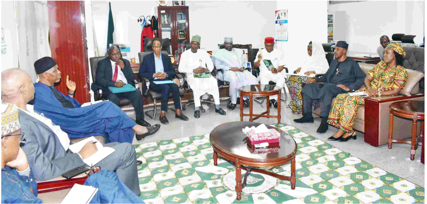
The Committee on the Status of Medical Education in Nigerian Universities, with the Executive Secretary during the presentation of the committee's report

Secretary that the Committee's assignment would be completed by the end of the month of April.