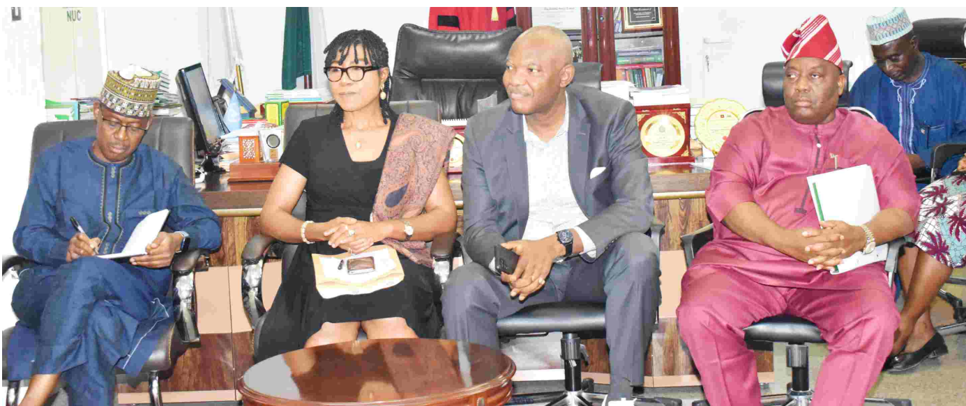
Some of the members of the NUC Management at the interactive meeting