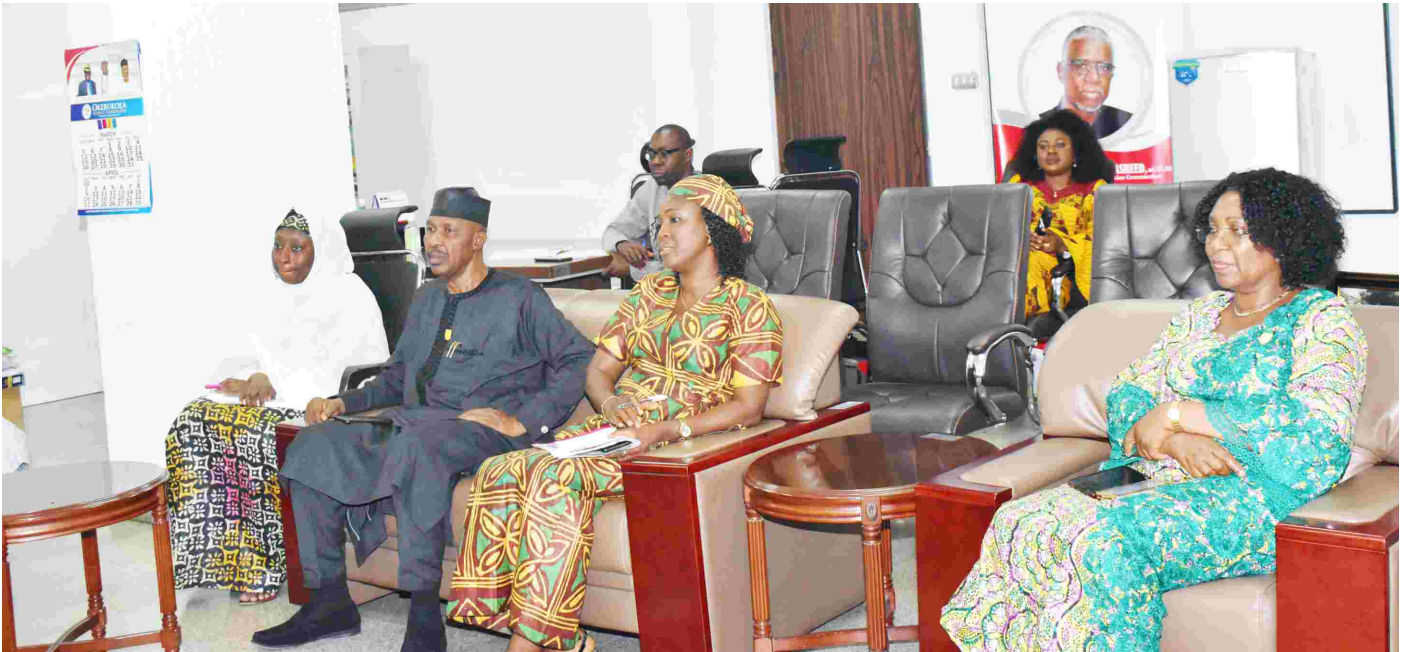
Other members of the Committee at the meeting