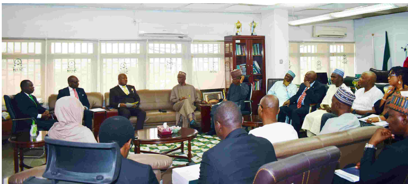
The meeting of the Executive Secretary with the Chartered Institute of Bankers of Nigeria delegation in session

The CIBN Vice Chairman congratulated the leadership of the Commission for the fit achieved in the review and launch of a brand new curriculum, the Core Curriculum Minimum Academic Standards (CCMAS) for the university system, acknowledging