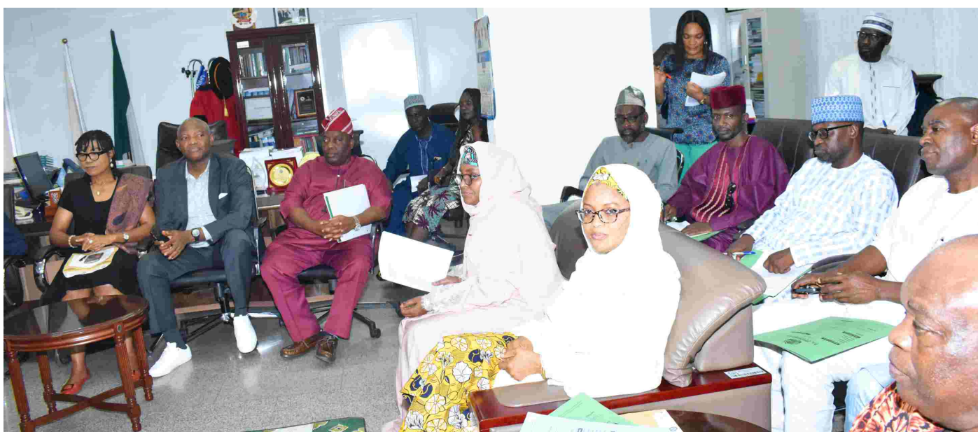
The meeting of the Executive Secretary with the promoters of Proposed Al-Muhibbah Open University, Nasarrawa in session

in the mixed media format by the course materials development team and would be submitted to the NUC in due course. She said worthy of mention was that the university was poised towards implementing the comprehensive Open Distance Learning (ODL) framework especially on matters related to training and retraining of staff.