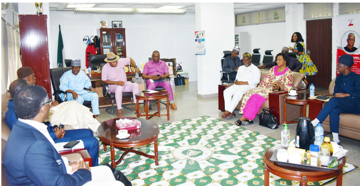
The Meeting of the Executive Secretary with the AWAU delegation in session

One of the areas where such synergy has been evidently harnessed, he averred, was in the management of the Africa Centers of Excellence project.