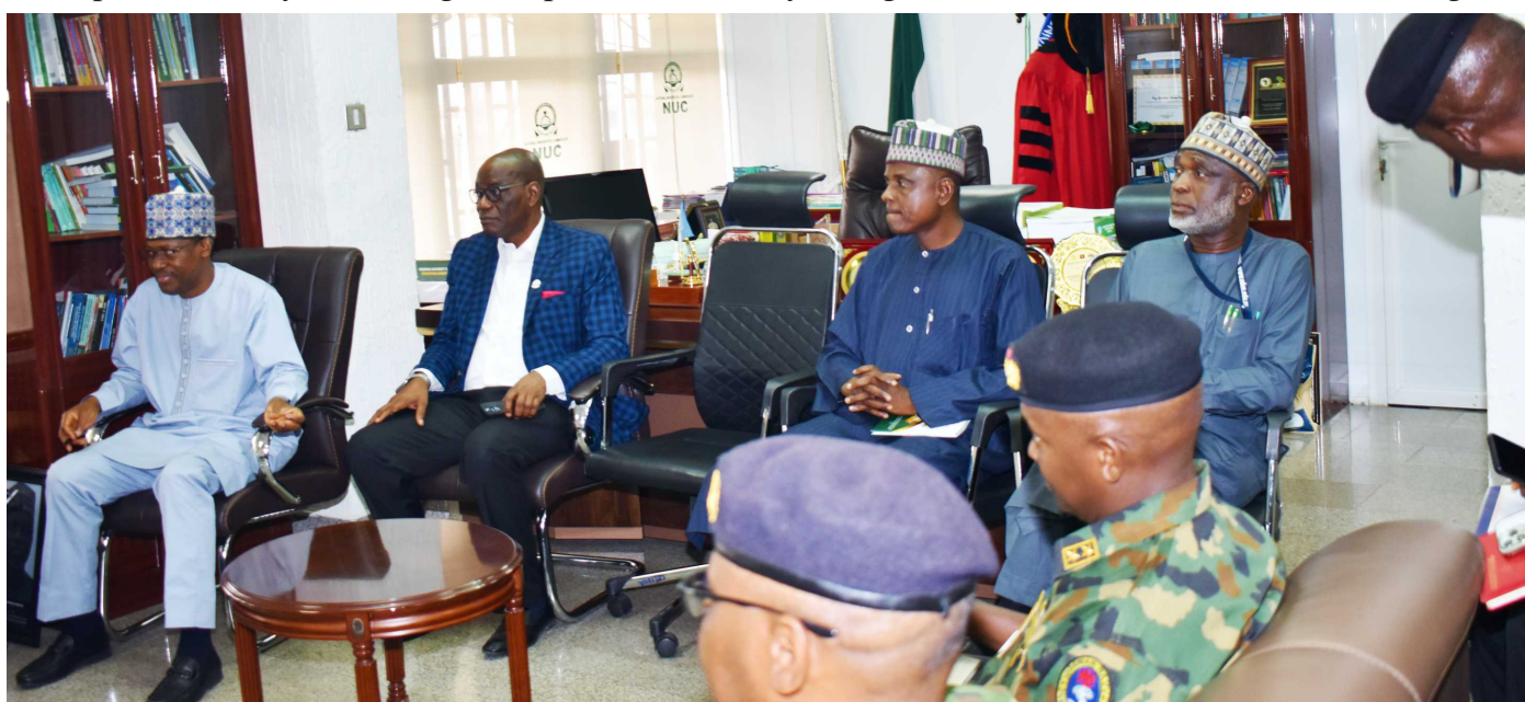
Some of the members of NUC Management and other stakeholders

Such areas included admission structure pertaining to certain admission requirements; merits, catchment areas and educationally less developed states would be considered by JAMB due to the change in