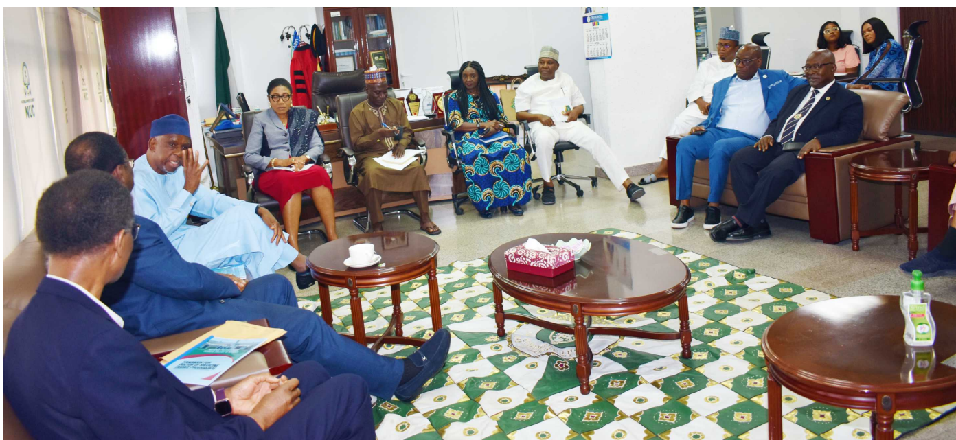
The Meeting of the Executive Secretary with the NPMC delegation in session

The President, National Postgraduate Medical College, in his address, thanked the Executive Secretary for granting them audience and commended him for the great innovations he had brought to university education in the country. He said the transition in the education