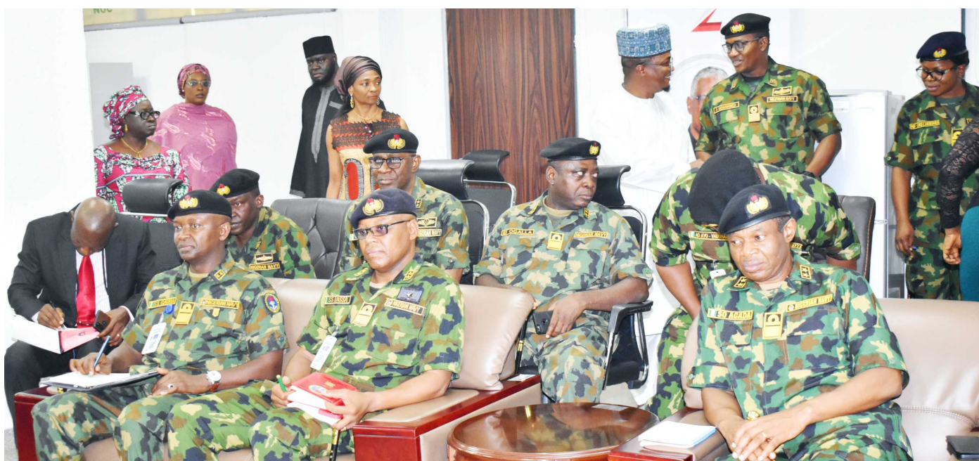
A cross session of the Senior Naval Officers at the meeting

other stakeholders on the new status of the University, including the Tertiary Education Trust Fund (TETFund) so as to include