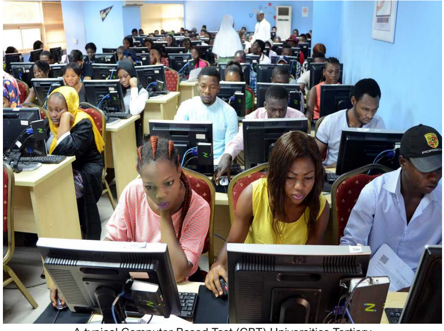
A typical Computer Based-Test (CBT) Universities Tertiary Matriculation Examination (UTME) Setting

Others are Interim Joint Matriculation Board A' Level, Joint Universities Preliminary Examination Board A'