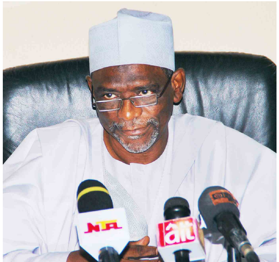
Mal. Adamu Adamu Honourable Minister of Education

The invitation letter to the Pro-Chancellors and Chairmen of