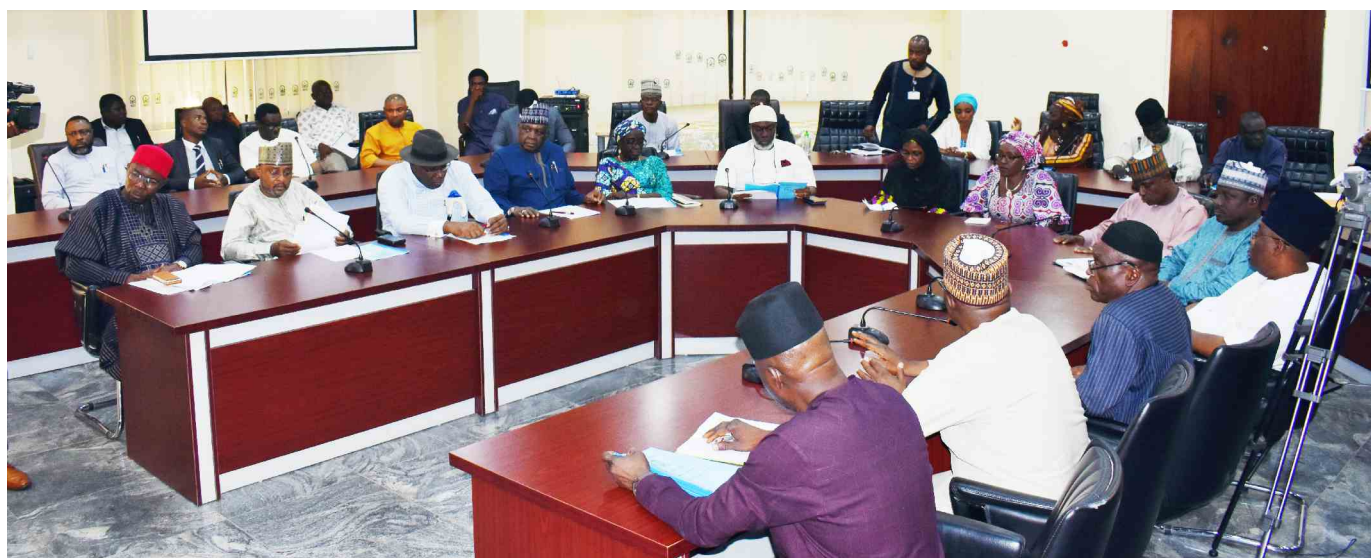
Meeting in session

On the submissions, the NUC similarly highlighted that its major activities within the year included major curriculum review, assessment of