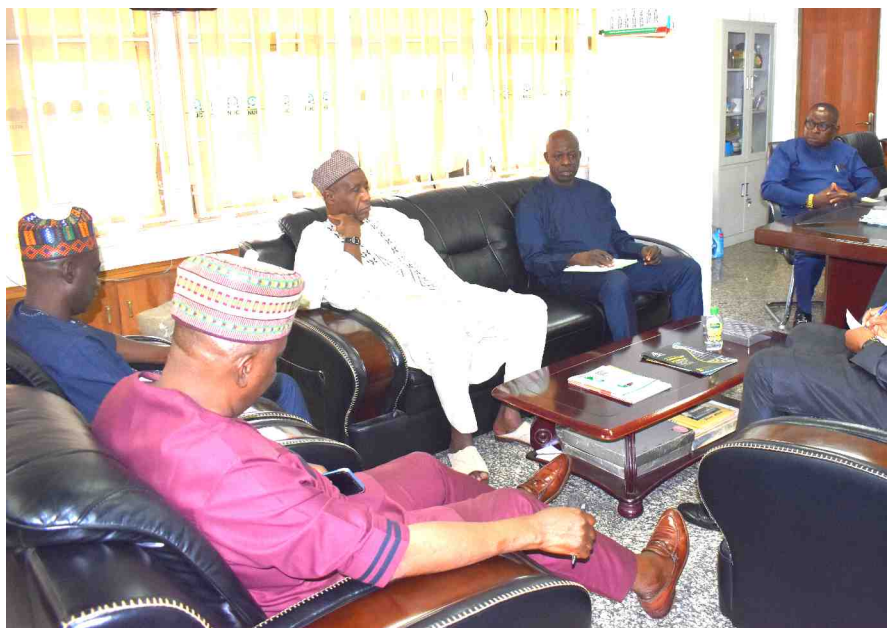
The meeting in session