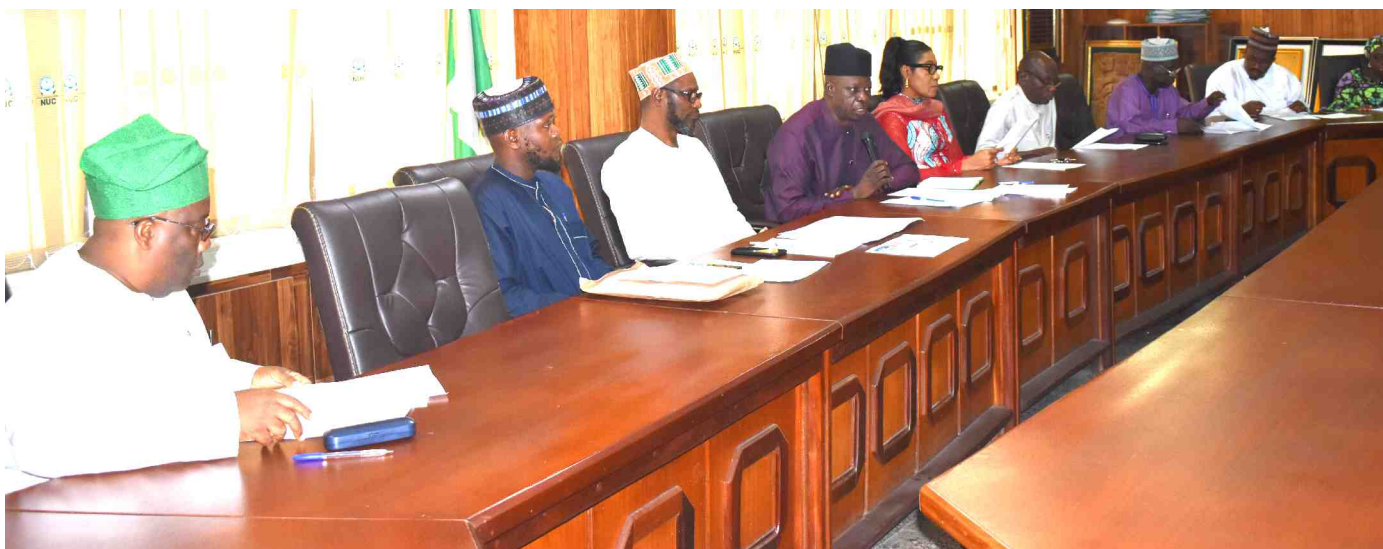
The NUC Management Team at the meeting with the IOU delegation from The Gambia

He informed the delegation that the National Open University of Nigeria (NOUN) was established with the older population in mind as a flagship Open University in Nigeria, enabling its graduates to be given a National Youth Service Corps (NYSC) exemption certificate upon completion regardless of age. He stated that this model will apply and suit the proposed graduates of the Gambian Institution.