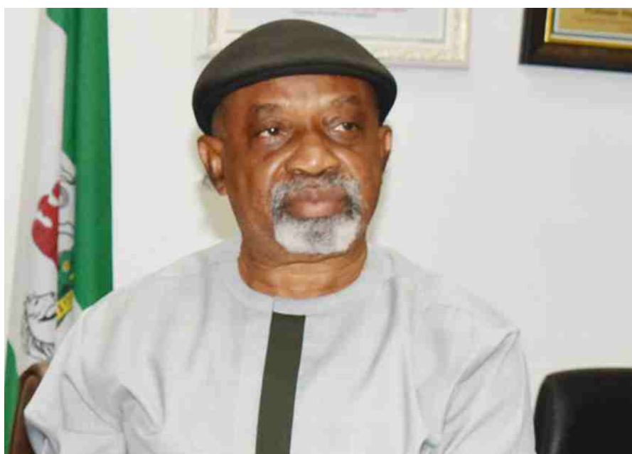
Senator Dr. Chris Ngige Minister of Labour and Employment

Solution (UTAS) and the Universities Peculiar Personnel Payroll