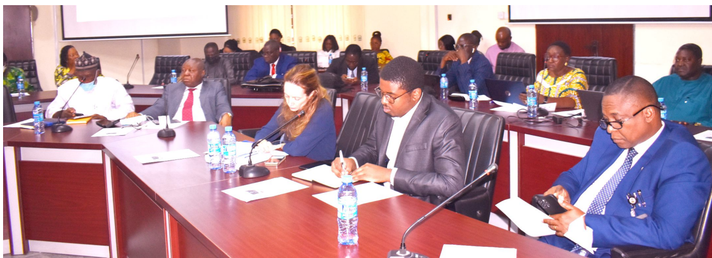
Cross section of some SPESSE Centre leader at the occasion

He reported that they already had 85% in PhD enrolment likewise