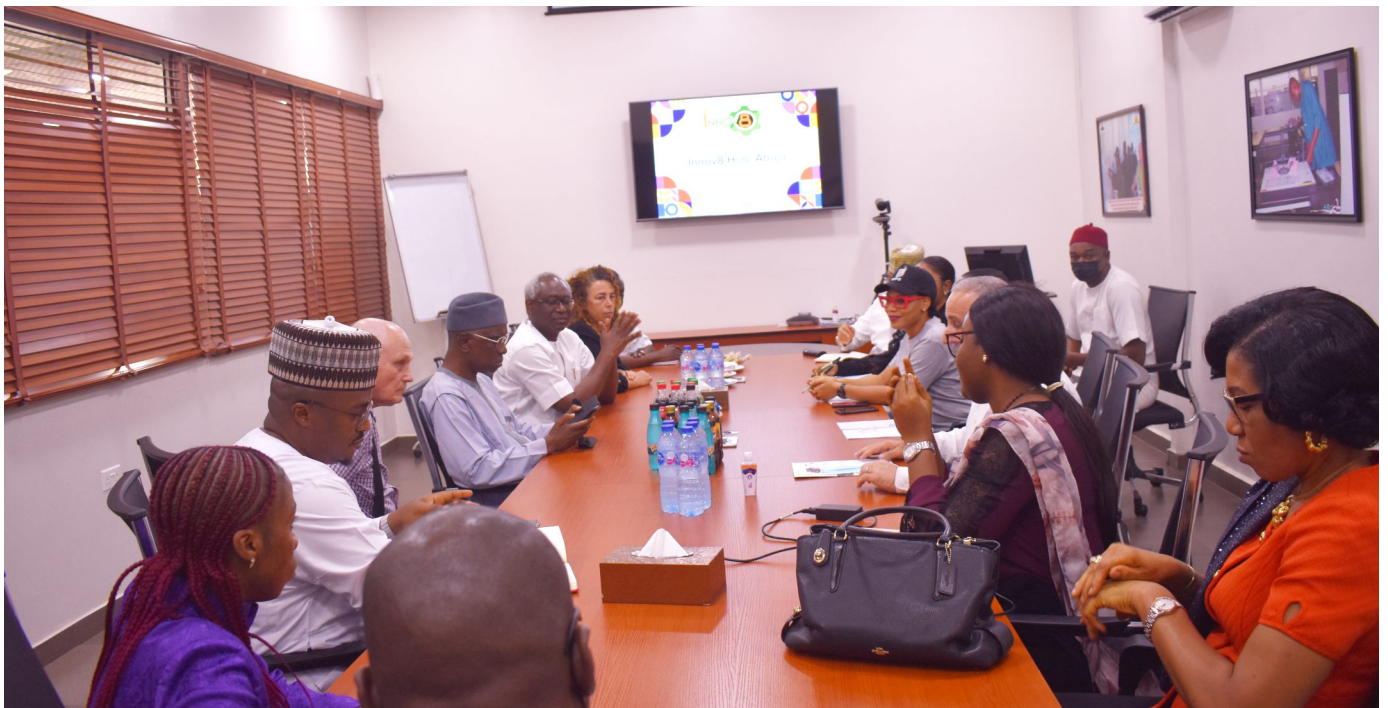
Meeting with the NUC Team and the Innovation Hub Centre

as academics and research activities have worked differently and proposed the need to strengthen technology in the Nigerian University System (NUS). He said, setting up effective technology hub in the higher institutions would solve lot of problems as units like the innovation hub model could be established since entrepreneurial centres already exist in the higher institutions.