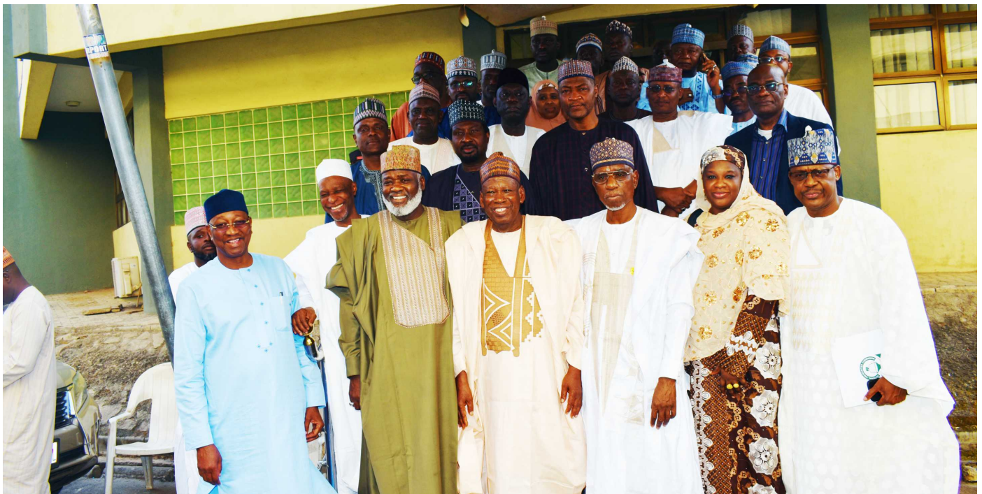
The ES, NUC and Governor Abdullahi Umar Ganduje in a group photograph after the presentation of the Recognition Letter of Sa'adatu Rimi University of Education, Kano