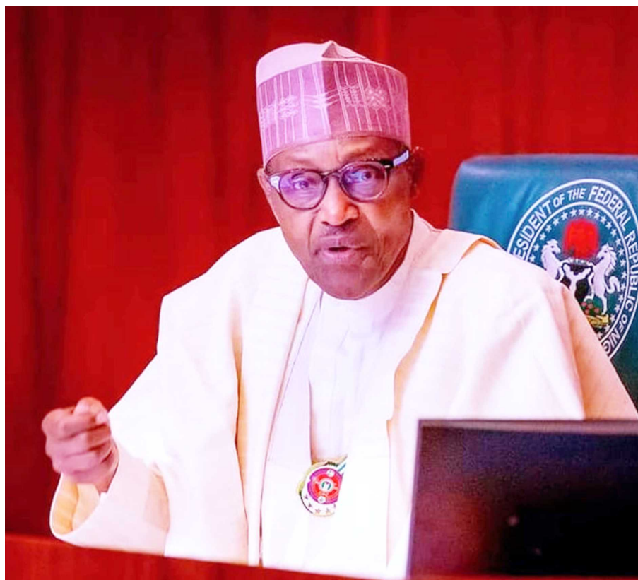
Muhammadu Buhari, GCFR President, Federal Republic of Nigeria

in line with the zero-tolerance stance of the government against corruption.