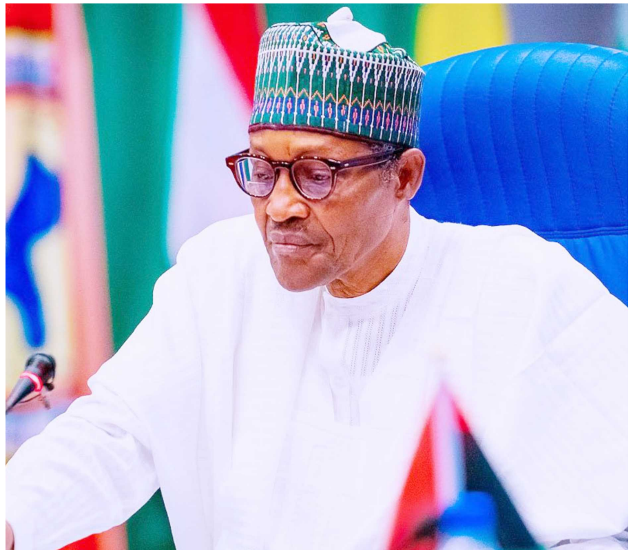
Muhammadu Buhari, GCFR President, Federal Republic of Nigeria