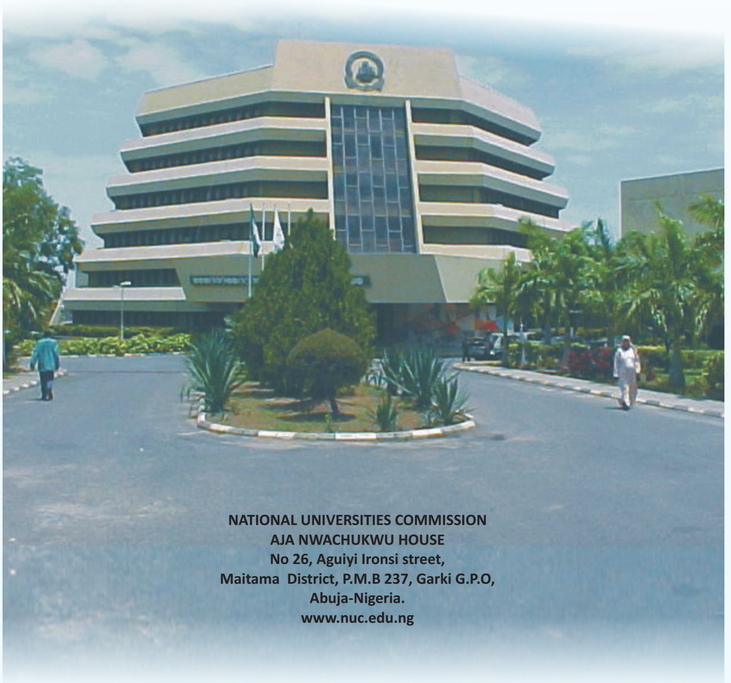
NATIONAL UNIVERSITIES COMMISSION AJA NWACHUKWU HOUSE No 26, Aguiyi Ironsi street, Maitama District, P.M.B 237, Garki G.P.O, Abuja-Nigeria. www.nuc.edu.ng