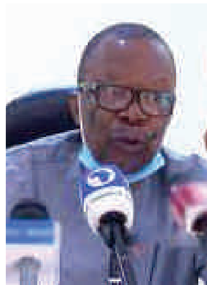
Prof. Emmanuel Osedeke ASUU President

The agreement, however, according to him, is subject to President Muhammadu Buhari's approval, who is currently attending the United Nations General Assembly meeting at the United Nations UN Office in New York.