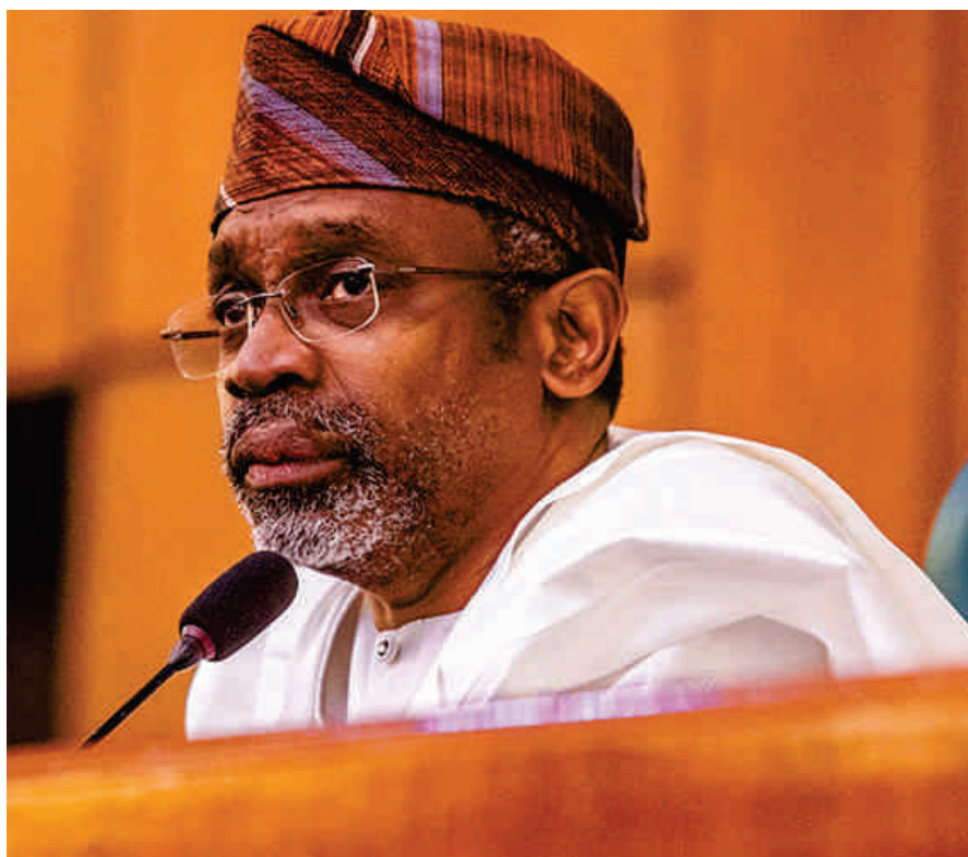
Rt. Hon. Femi Gbajabiamila Speaker, House of Representatives

door session, the Speaker insisted that both parties must find a middle ground towards resolving the strike that has