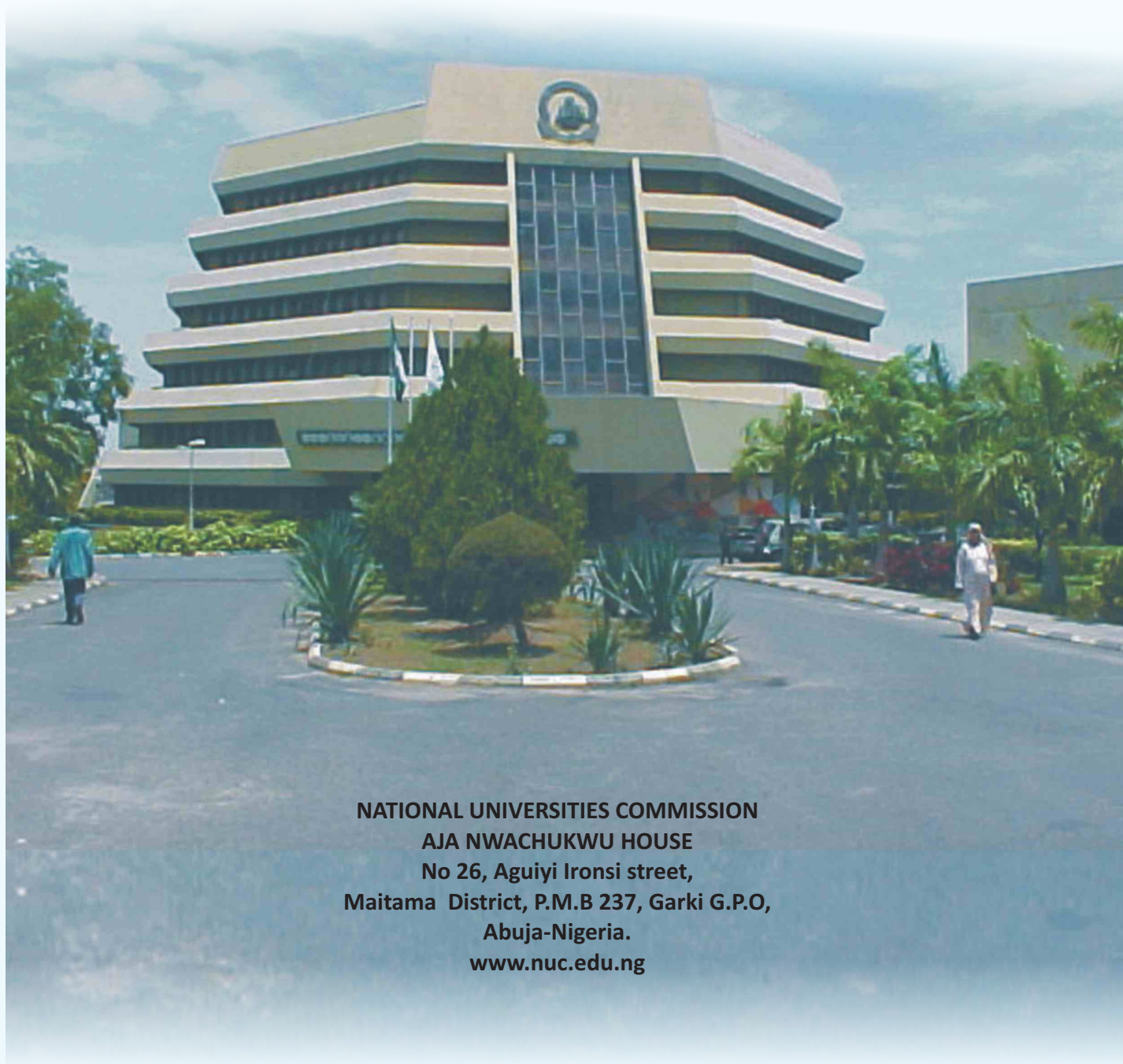
NATIONAL UNIVERSITIES COMMISSION AJA NWACHUKWU HOUSE No 26, Aguiyi Ironsi street, Maitama District, P.M.B 237, Garki G.P.O, Abuja-Nigeria. www.nuc.edu.ng