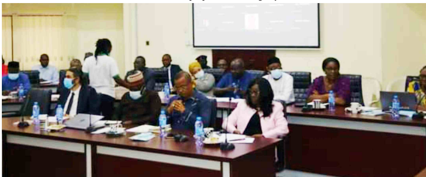
A cross section of more participants at the meeting

The Federal Ministries of Environment and Finance also