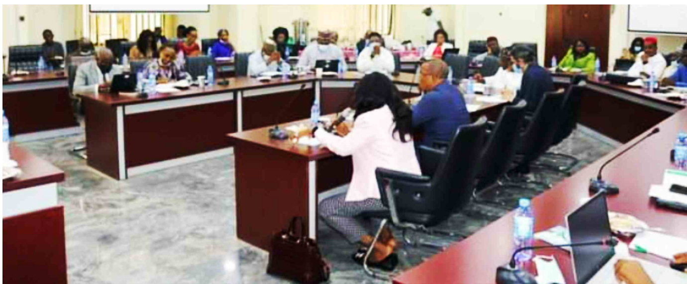
A cross section of participants at the ongoing SPESSE Implementing Support taking place at the NUC Secretariat

Other institutions whose Centre Leaders gave reports on their SPESSECE achievements, long-term plans, next steps, immediate plans, challenges and expectations from the World Bank were the University of Lagos (UNILAG); Federal University of Agriculture Makurdi (now Joseph