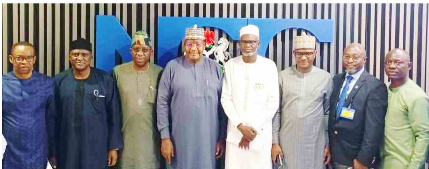
Group photograph of NCC and UDUS officials

The HRD said the initiatives which are policy-driven were instituted as a proof of the Commission's appreciation of the importance of working with stakeholders to engender