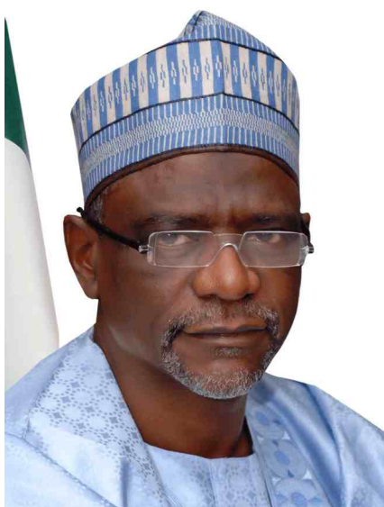
Mal. Adamu Adamu Minister of Education

Adamu, while congratulating the winners, applauded the efforts of