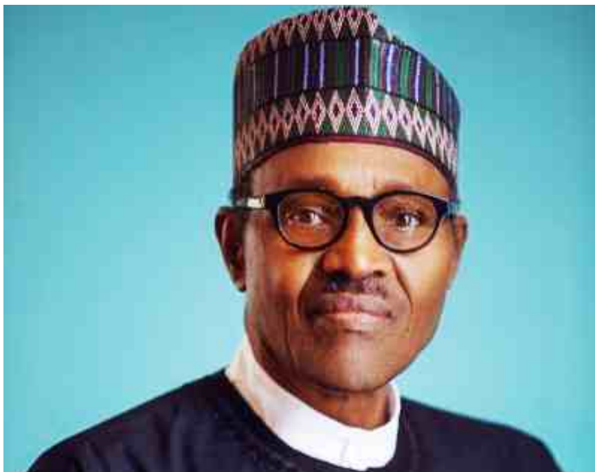
Muhammadu Buhari President and Commander-In-Chief Federal Republic of Nigeria

negotiation with the Academic Staff Union of Universities (ASUU) which brought to an end the 8-month industrial