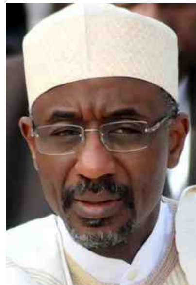
Sanusi Lamido Sanusi Chancellor, Ekiti State University

In his words, “I assure His Excellency that this appointment will only further encourage me to continue joining hands with Fayemi, as we seek to make contributions to resolving some of the intractable issues currently facing this country”.