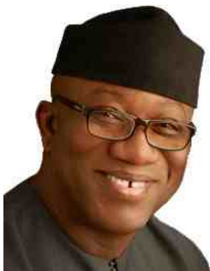
Dr. Kayode Fayemi Executive Gov. Ekiti State

The Governor, of Ekiti State, Dr. Kayode Fayemi last Thursday, decorated the 14th