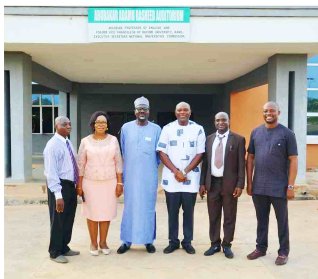
Group photo in front of the commissioned Prof. Abubakar Rasheed Auditorium