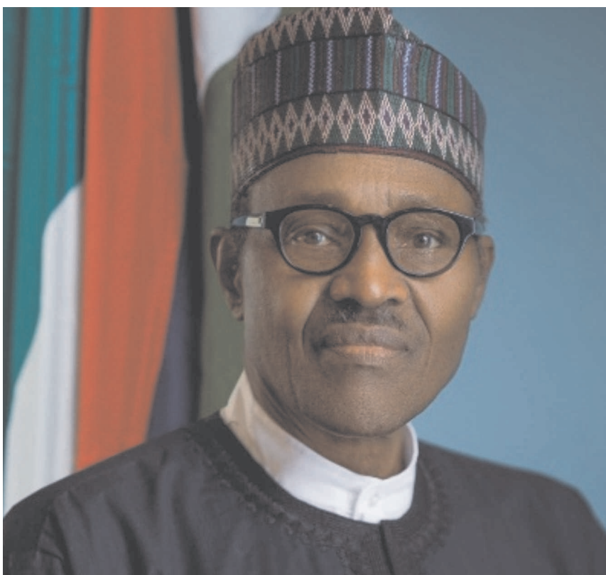
Muhammadu Buhari President, Federal Republic of Nigeria