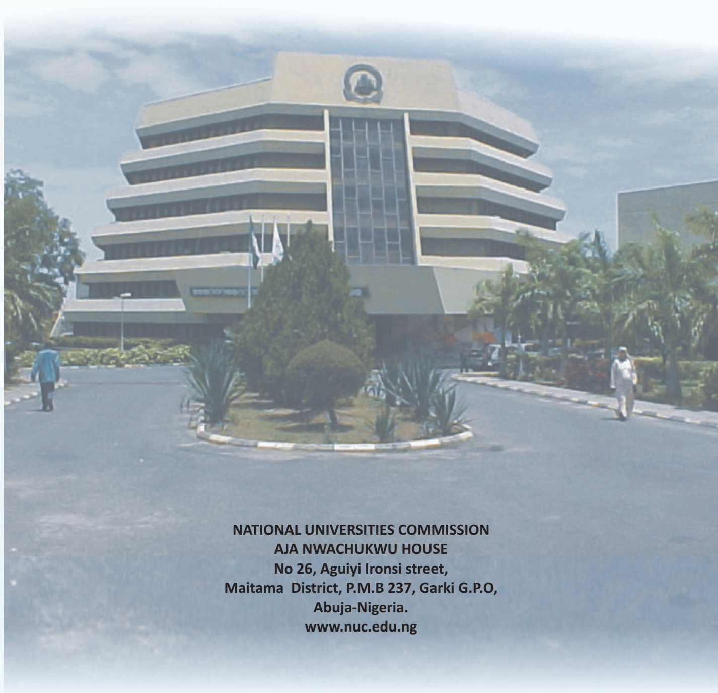
NATIONAL UNIVERSITIES COMMISSION AJA NWACHUKWU HOUSE No 26, Aguiyi Ironsi street, Maitama District, P.M.B 237, Garki G.P.O, Abuja-Nigeria. www.nuc.edu.ng