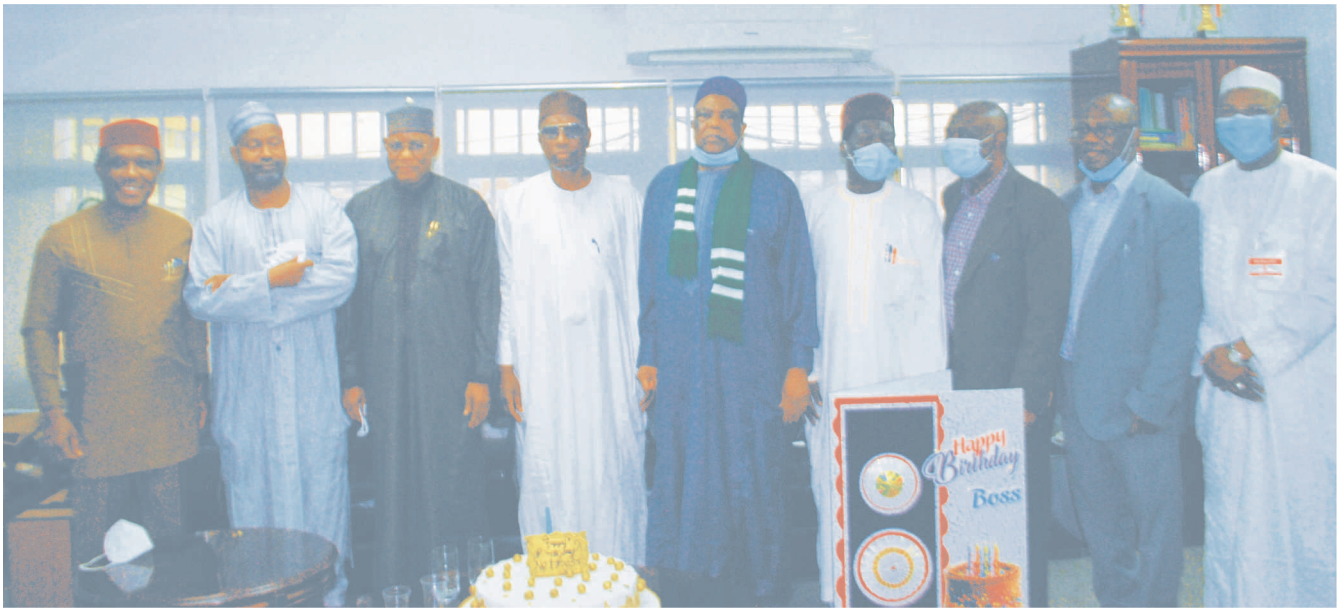
The celebrant (4th left) in a group photo with some visiting professors