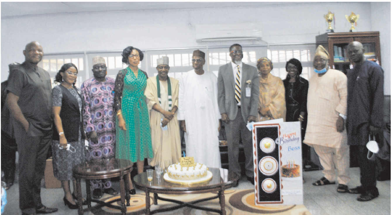
The celebrant (middle) with NUC Management staff

stated that he felt humbled and honoured by the kindness exhibited by his staff and by all those who had honoured the invitation to celebrate him. He wished them well and asked God to bless them all.