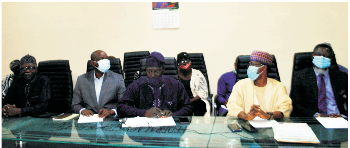
The Panel members

World Bank and its affiliate and organized private sector and the scientific/academic