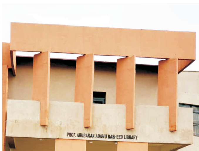
The Prof. Abubakar Adamu Rasheed Library Complex