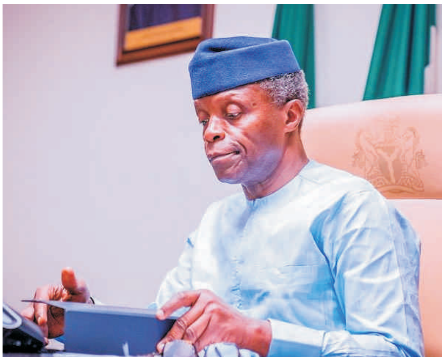
Prof. Yemi Osinbajo Vice President, Federal Republic of Nigeria

all tertiary institutions in Nigeria, including training programmes for lecturers to enable them deliver distance learning to their students.