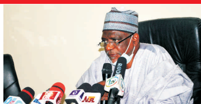
Unilag Panel Submits Report Pg. 3