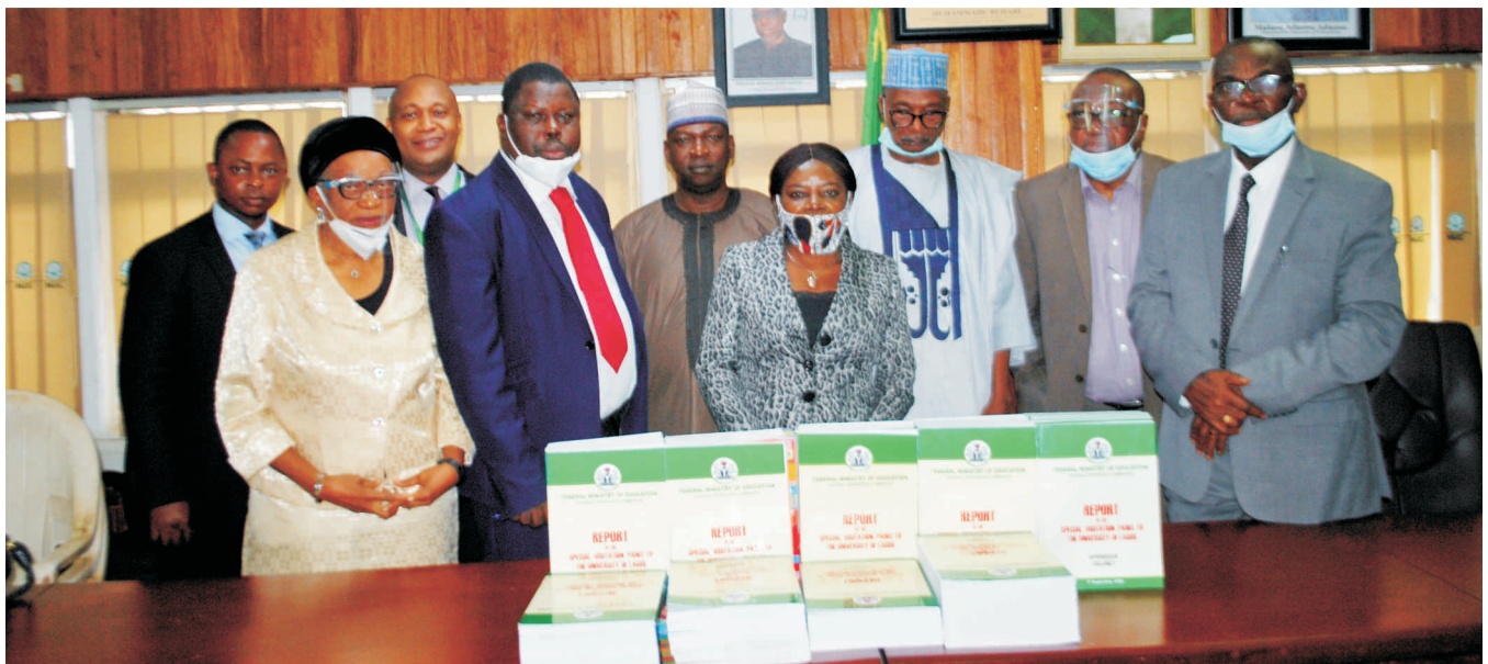
The Panel members after submission of their report

whether due process was followed as stipulated in the Universities (Miscellaneous Provisions) (Amendment) Act,