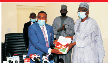
AUST Administrative Audit Panel Submit Report Pg. 2