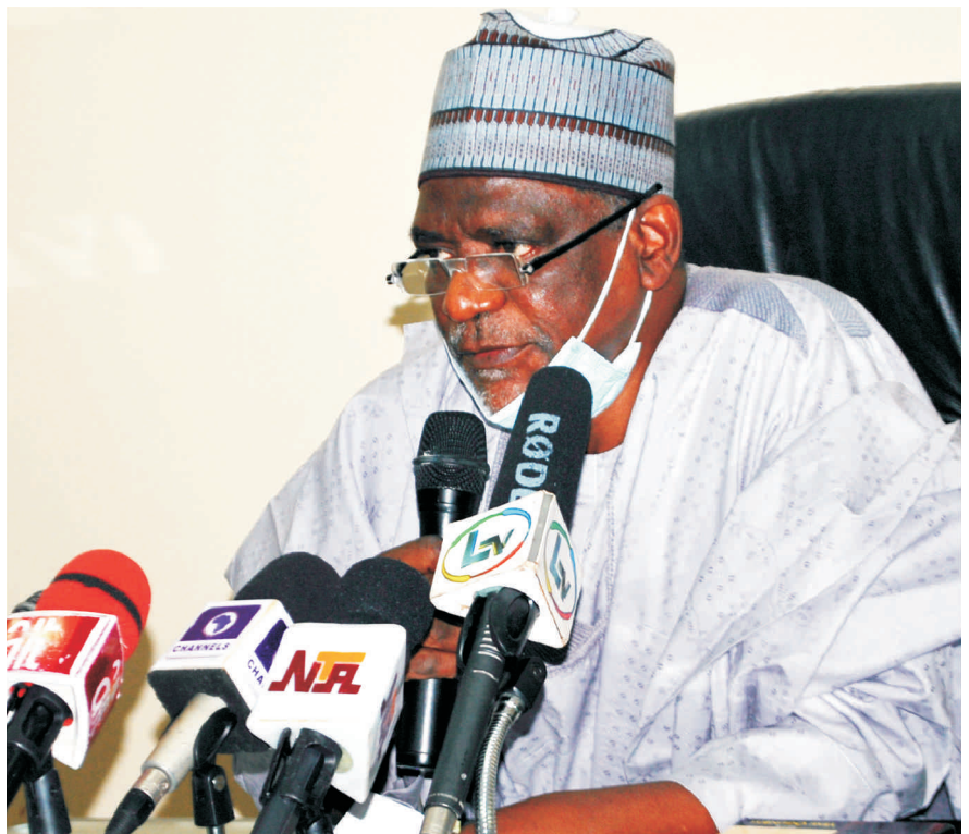
Mal. Adamu Adamu Hon. Minister of Education

supposed to contribute to the solution of the crisis as well as appropriate after due consideration of the report in